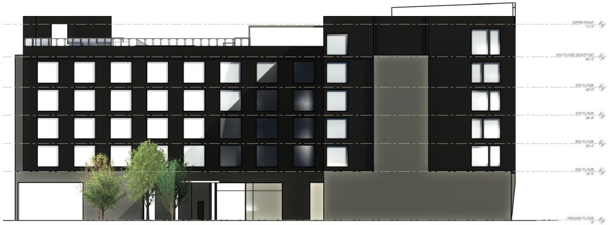
Previously Approved North Façade – Internal and facing toward 2 nd St.