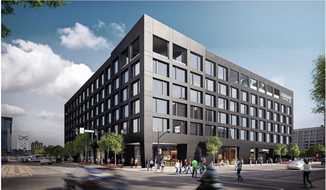
Previously Approved Design – Main Corner of 2 nd & Market