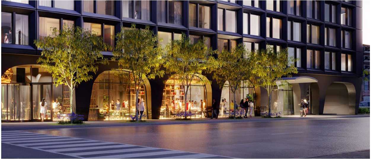
Currently Proposed Design – Street Level Along Market St.