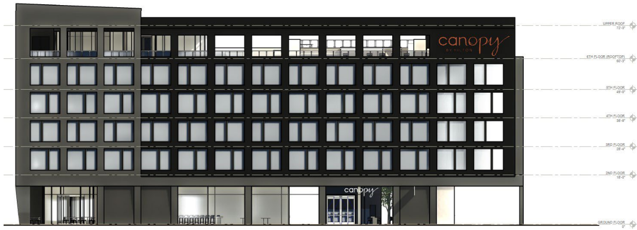
Previously Approved South Façade – Market St.