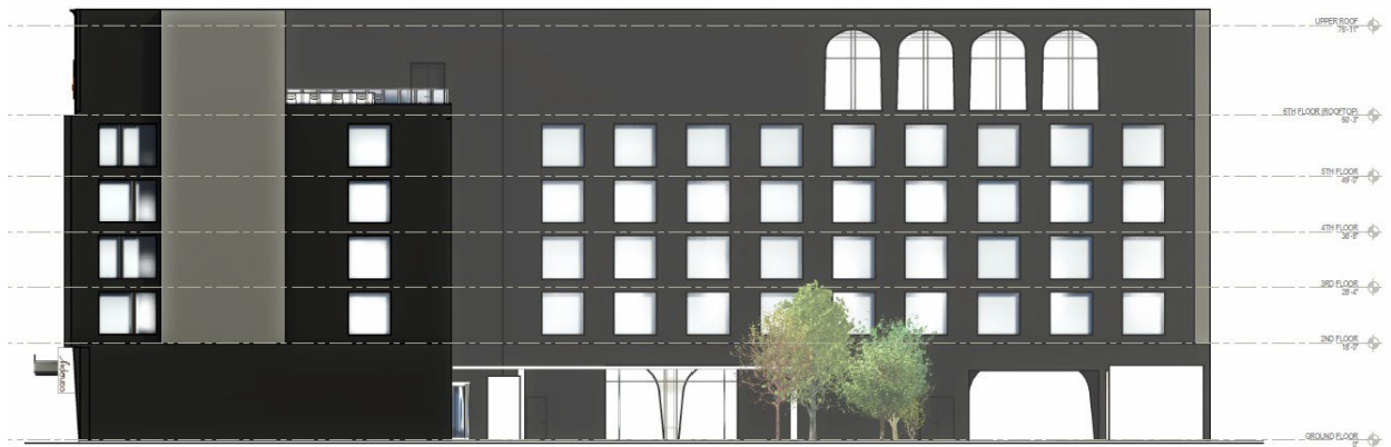
Currently Proposed East Façade – Internal and facing toward Market