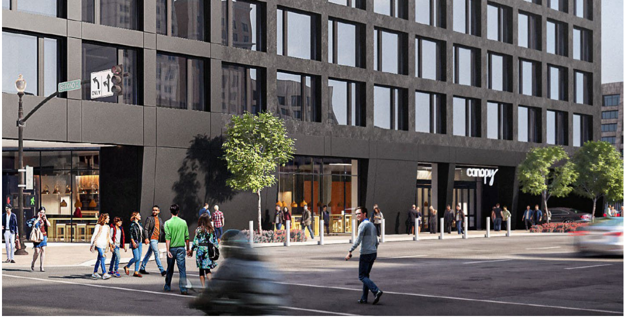
Previously Approved Design – Street Level Along Market St.