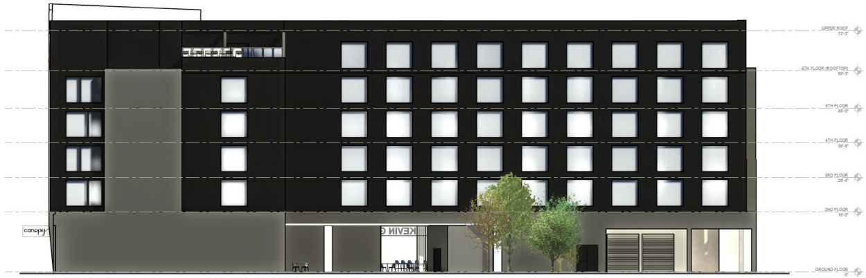
Previously Approved East Façade – Internal and facing toward Market St.