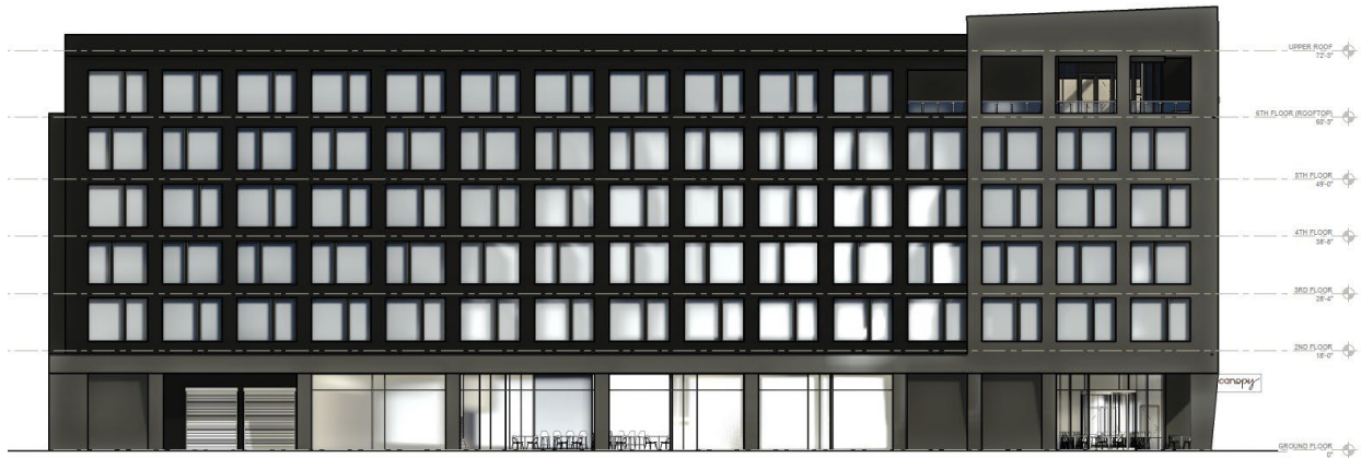
Previously Approved West Façade – 2 nd St.