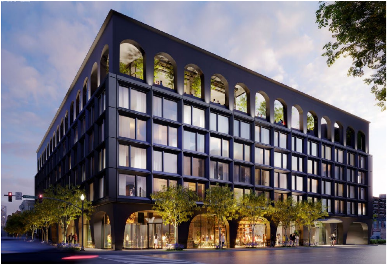
Currently Proposed Design – Main Corner of 2 nd & Market