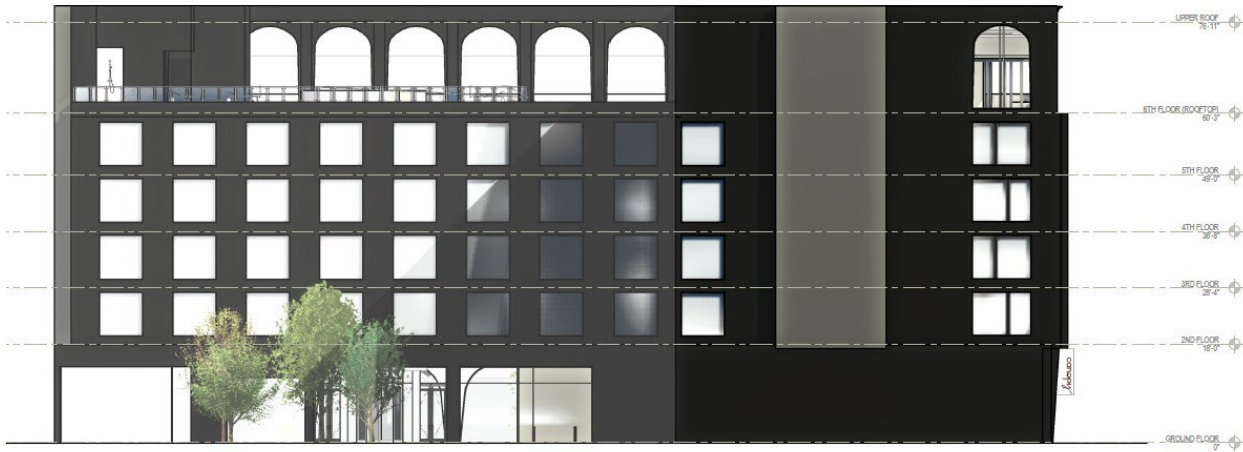
Currently Proposed North Façade – Internal and facing toward 2 nd St.