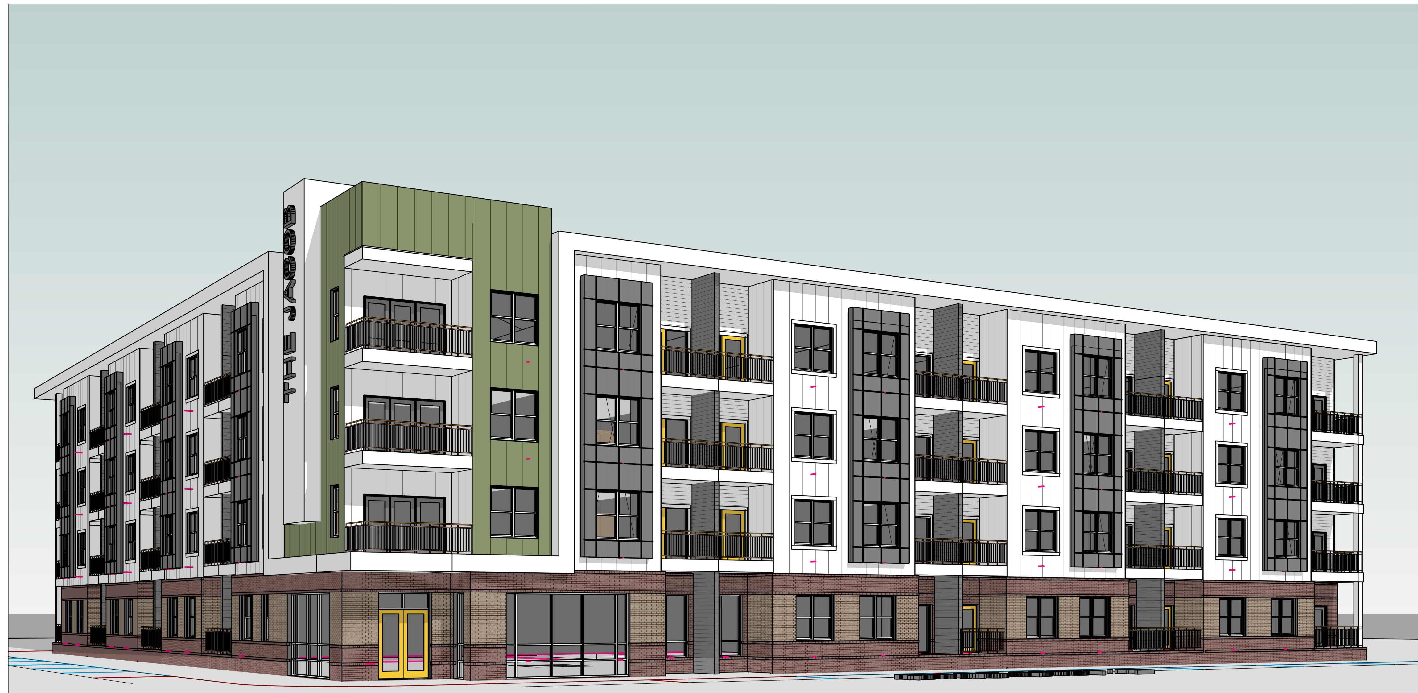
1 3D View 1 SD2.102