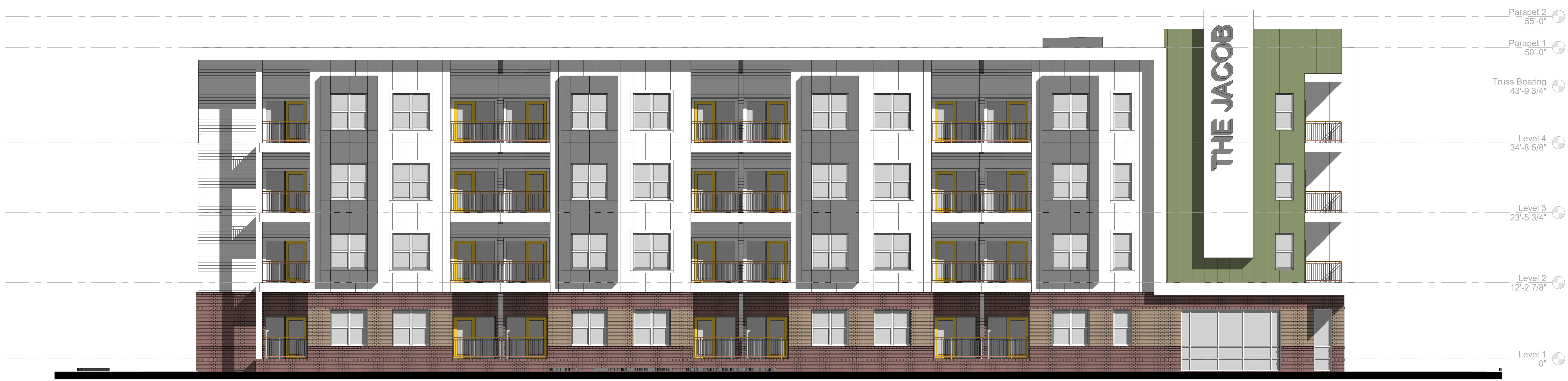
3 Schematic Elevation- East SD2.101 1/8" = 1'-0"