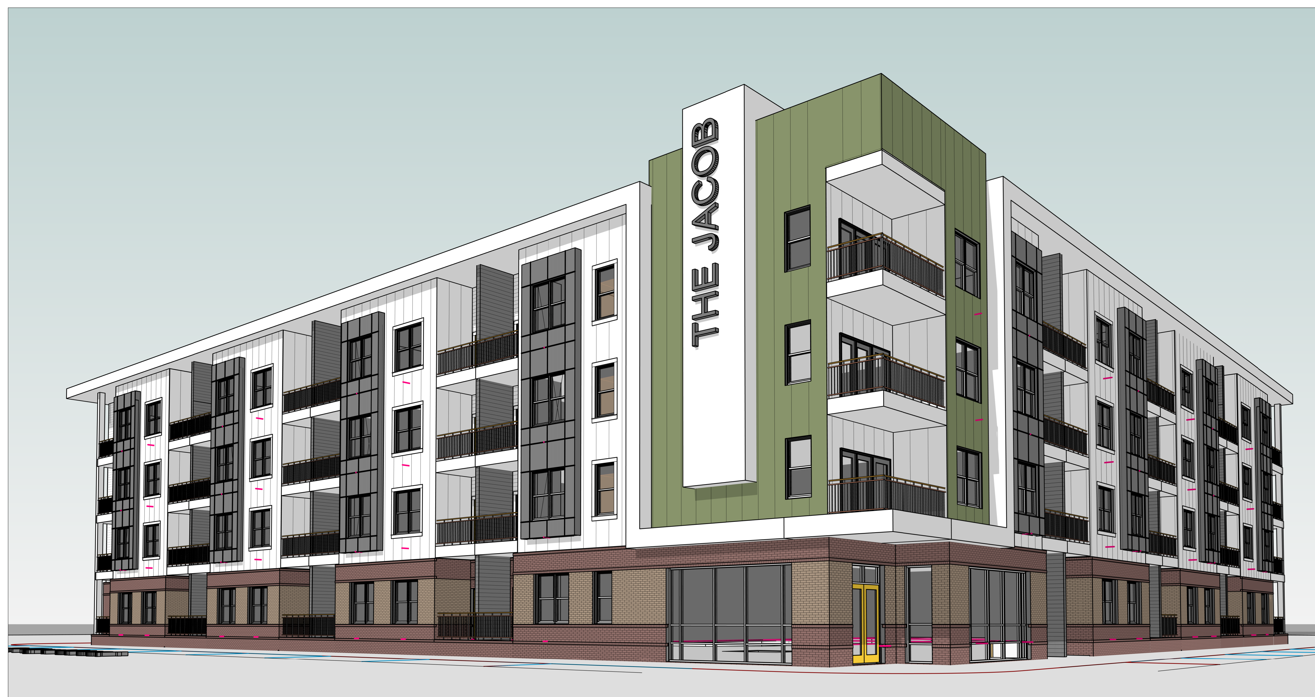
2 3D View 2 SD2.102