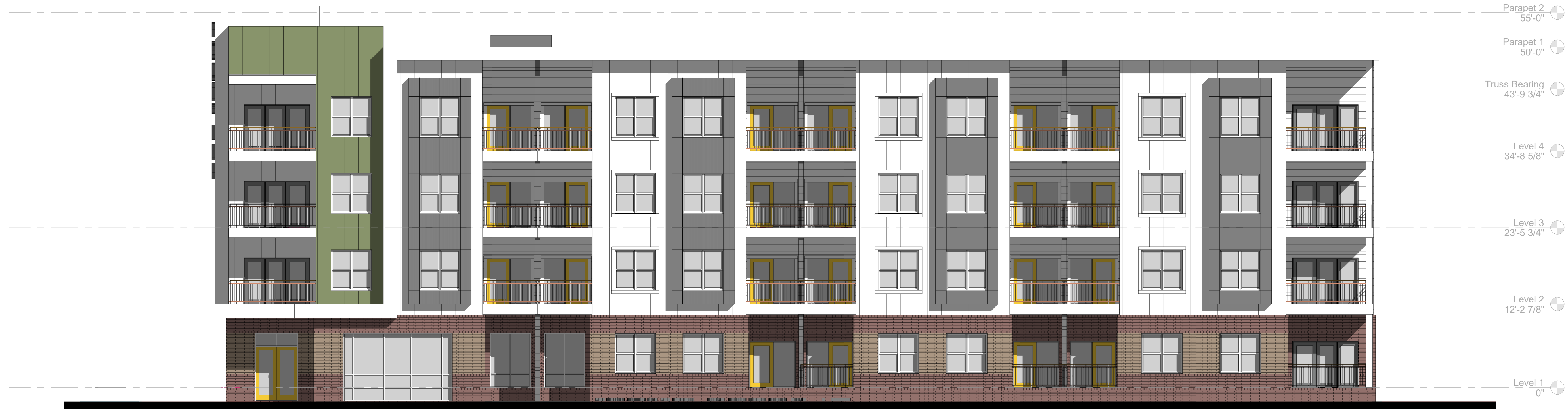
1 Schematic Elevation- North SD2.101 1/8" = 1'-0"