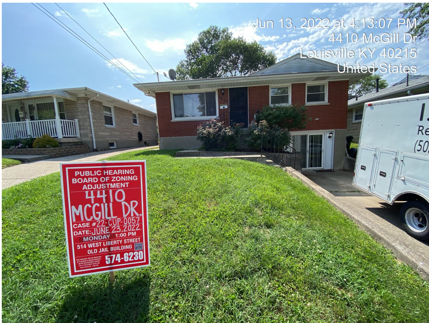
Front of subject property.