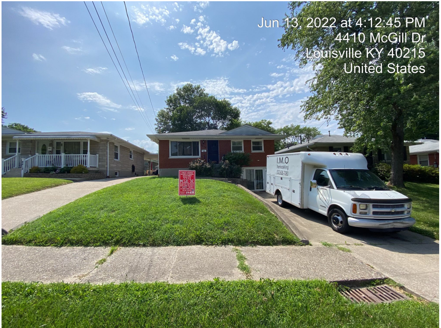
Front of subject property and neighboring houses