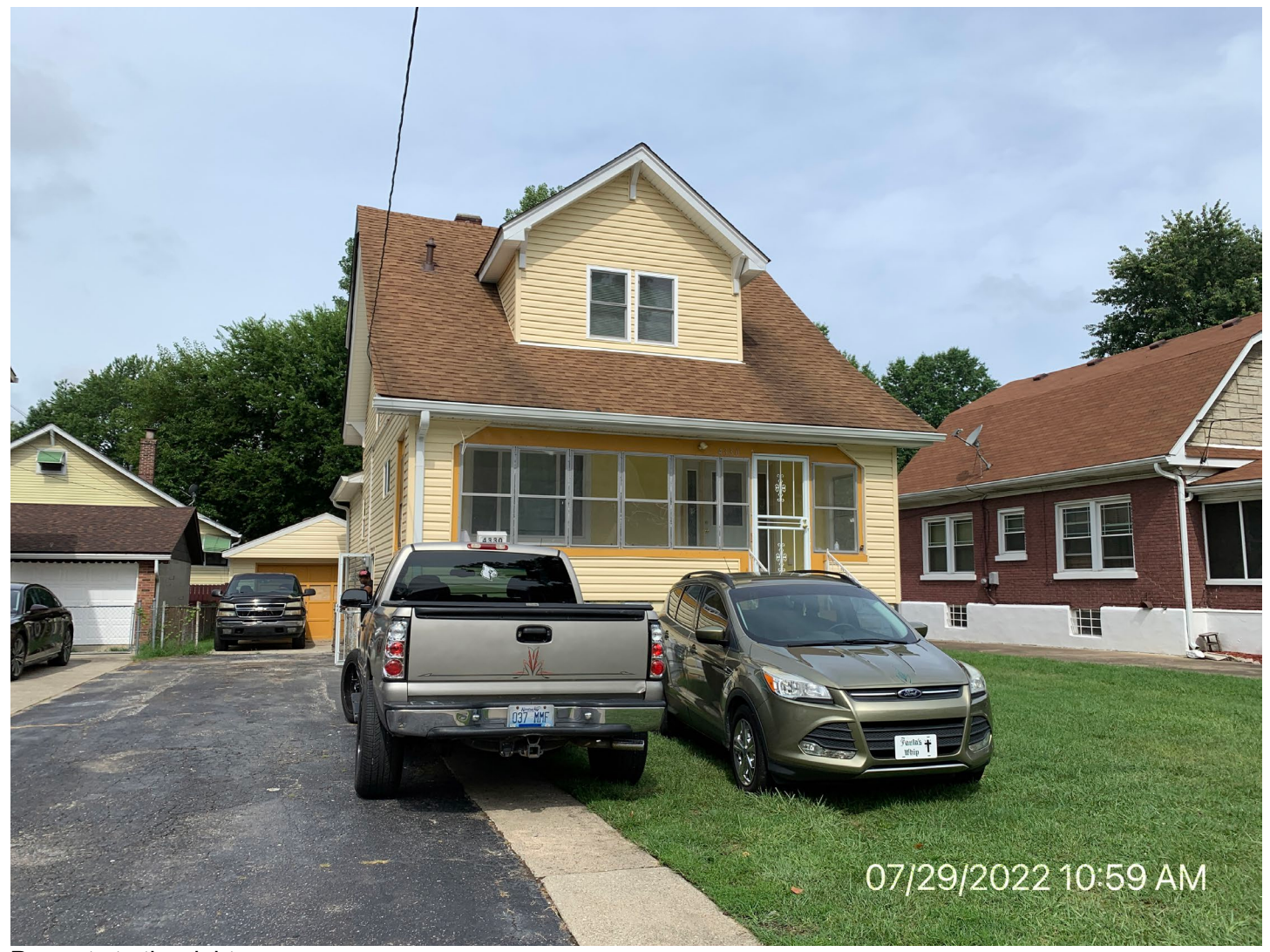
Property to the right.