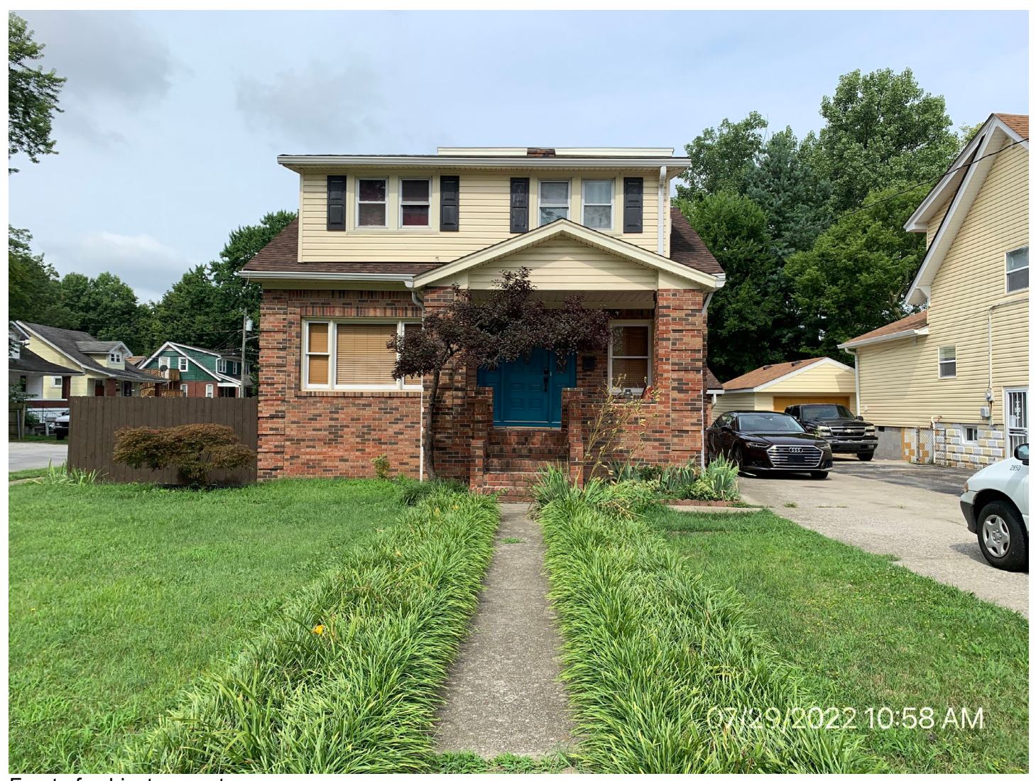
Front of subject property.