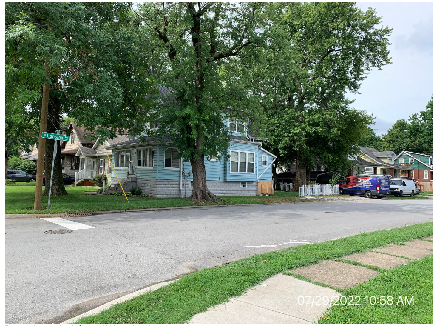
Properties to the left and W.Lansing Ave.