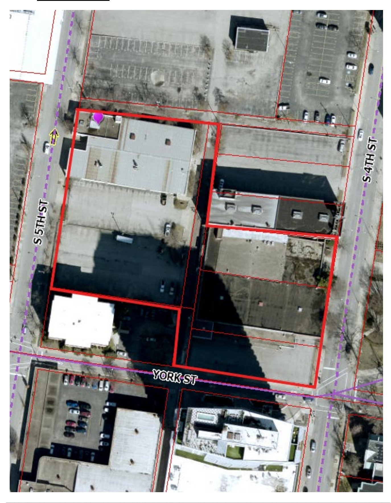
Published Date: September 8, 2022 Page 4 of 6 Case 22-DDP-0021