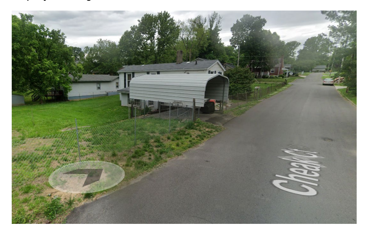
Property to the Left Across Cheak Court