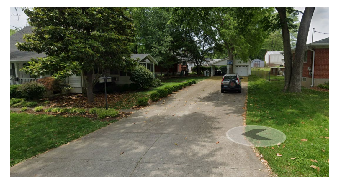
Driveway of Subject Property