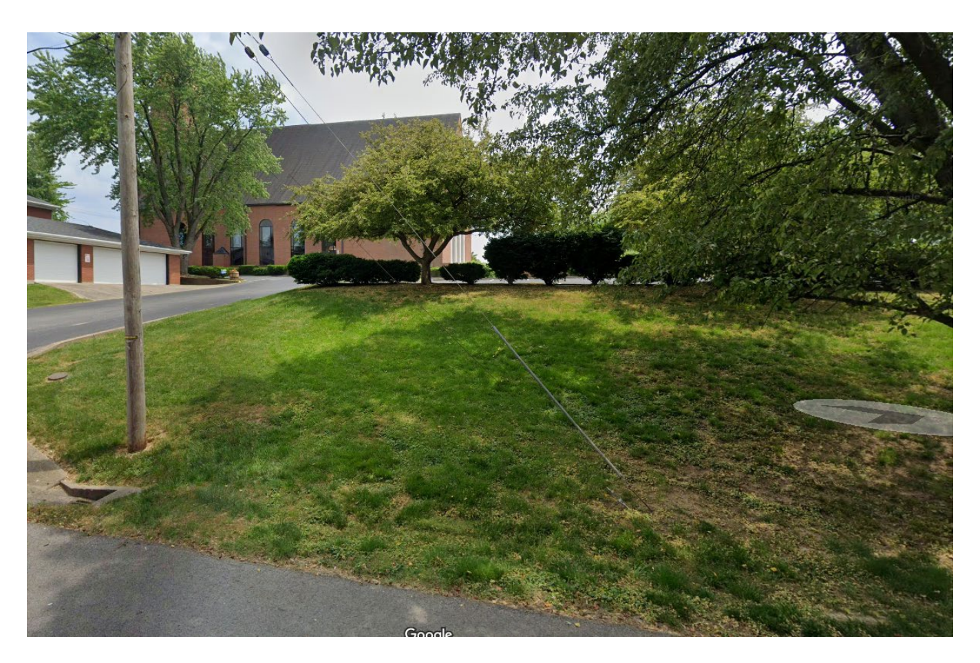
Property Across Cheak Street from Subject Property