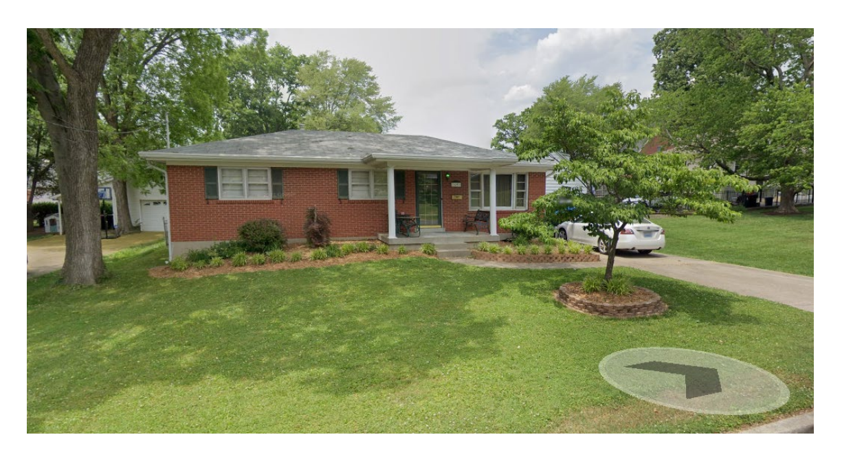
Property to the Right