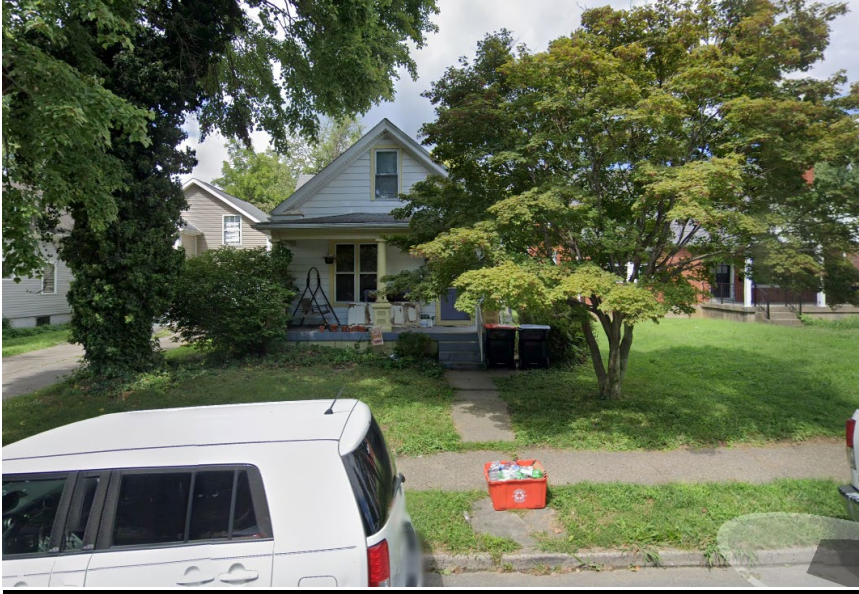
Property to the left