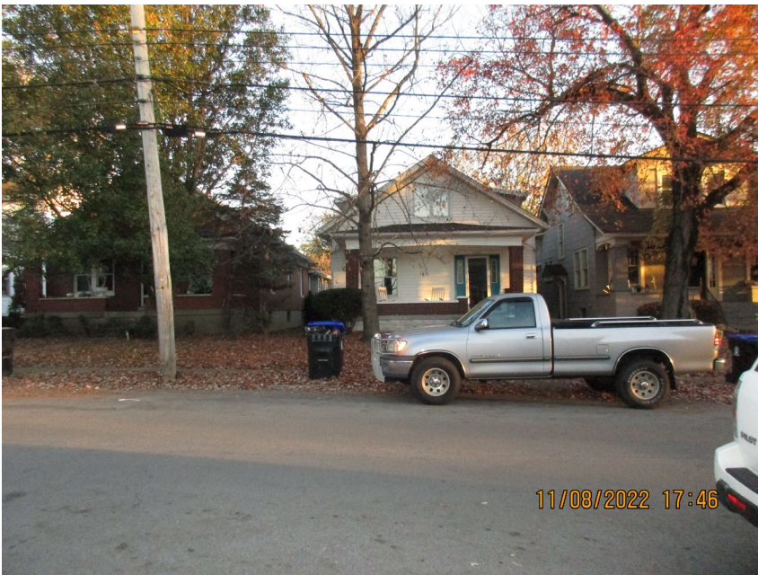
Properties across the street