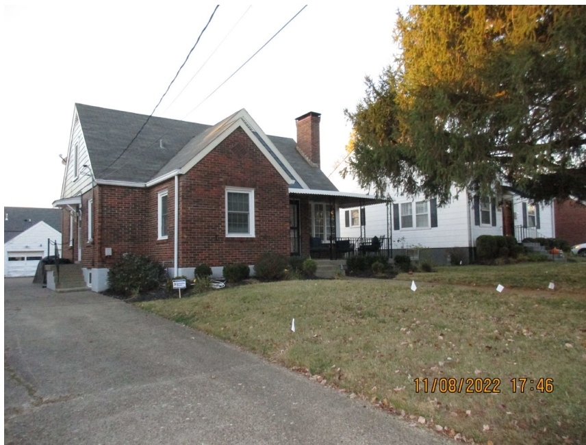
Property to the right