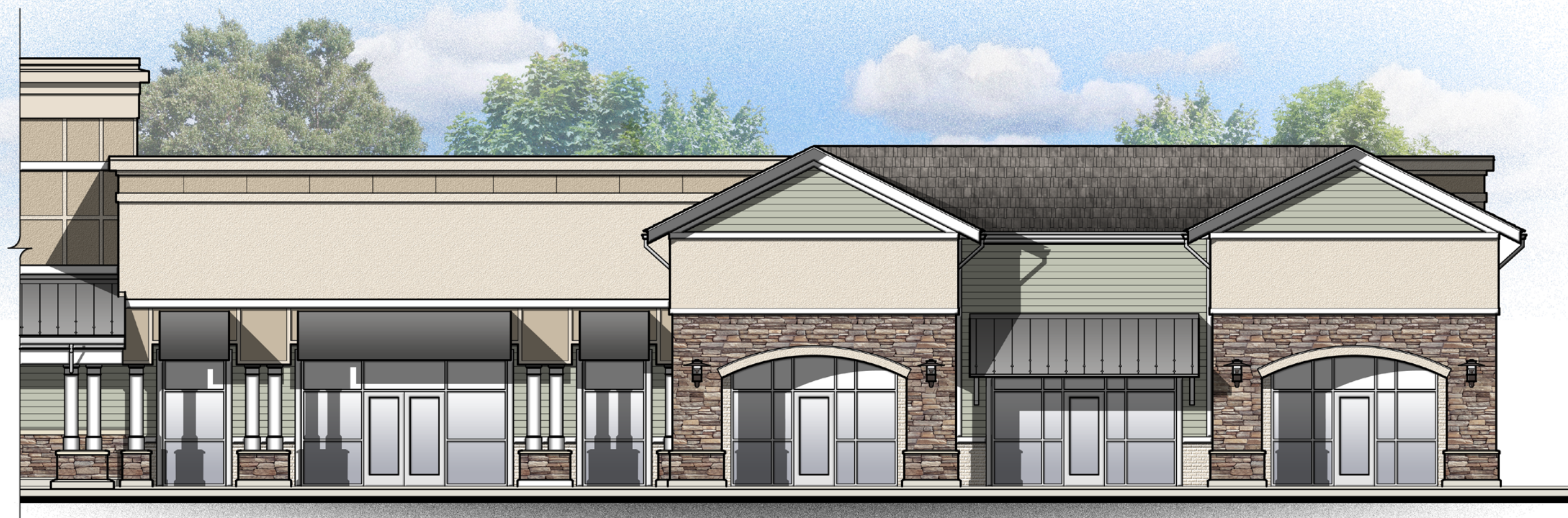
FRONT ELEVATION SCALE: 1/8" = 1'-0"