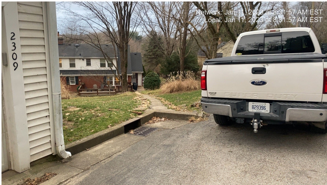
Parking at the rear of the site