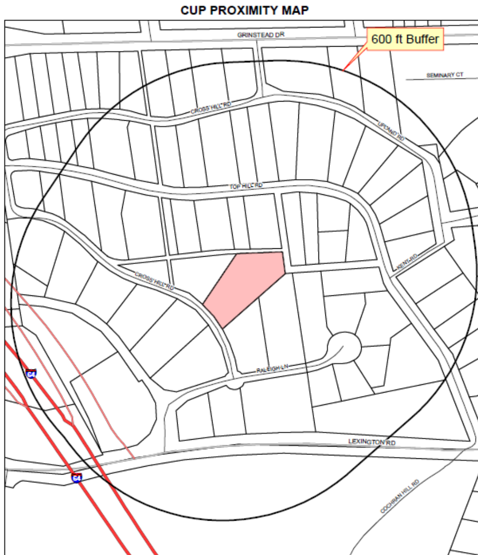
Case #22-CUP-0367 Map Created: 01/10/2023