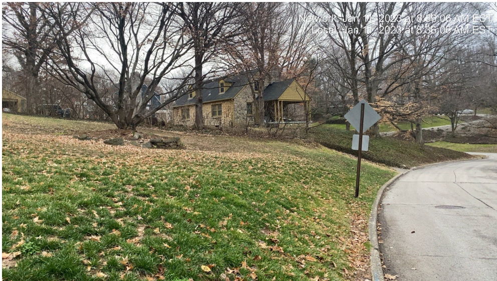
Adjacent Property to the Right