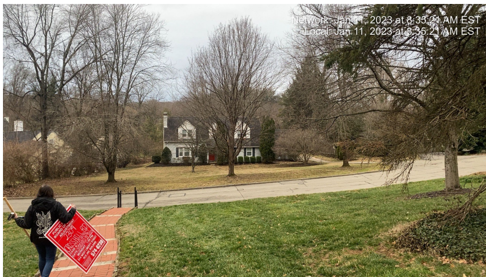
Property Across the Street