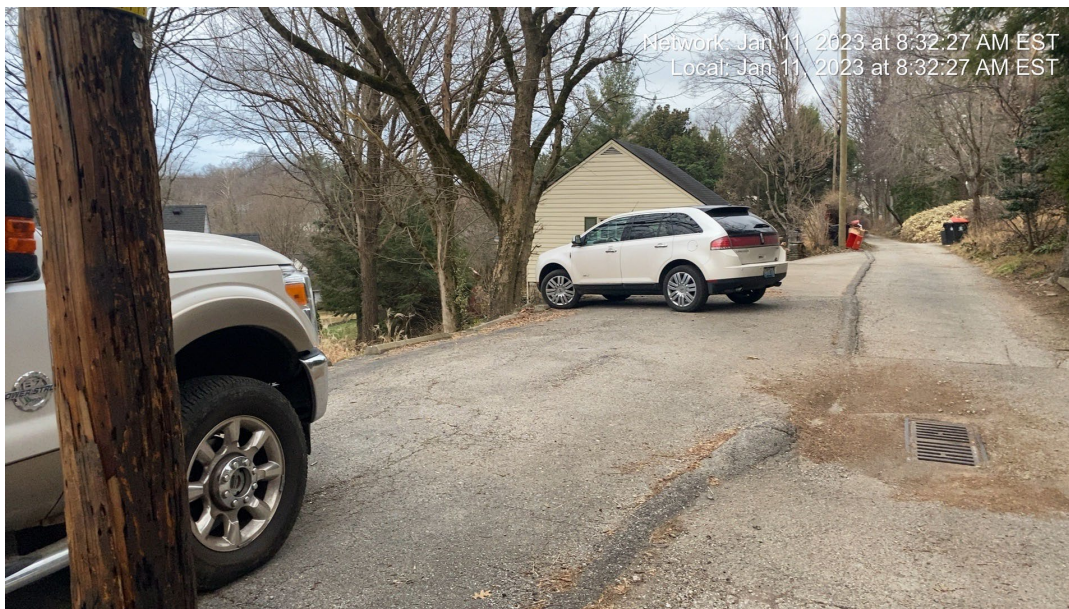
Street at the rear of the property