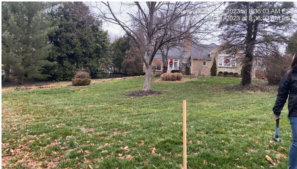
Adjacent Property to the Left