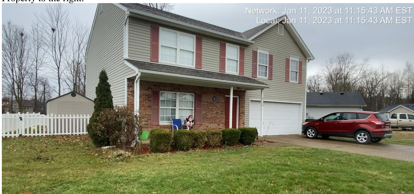
Property to the left.