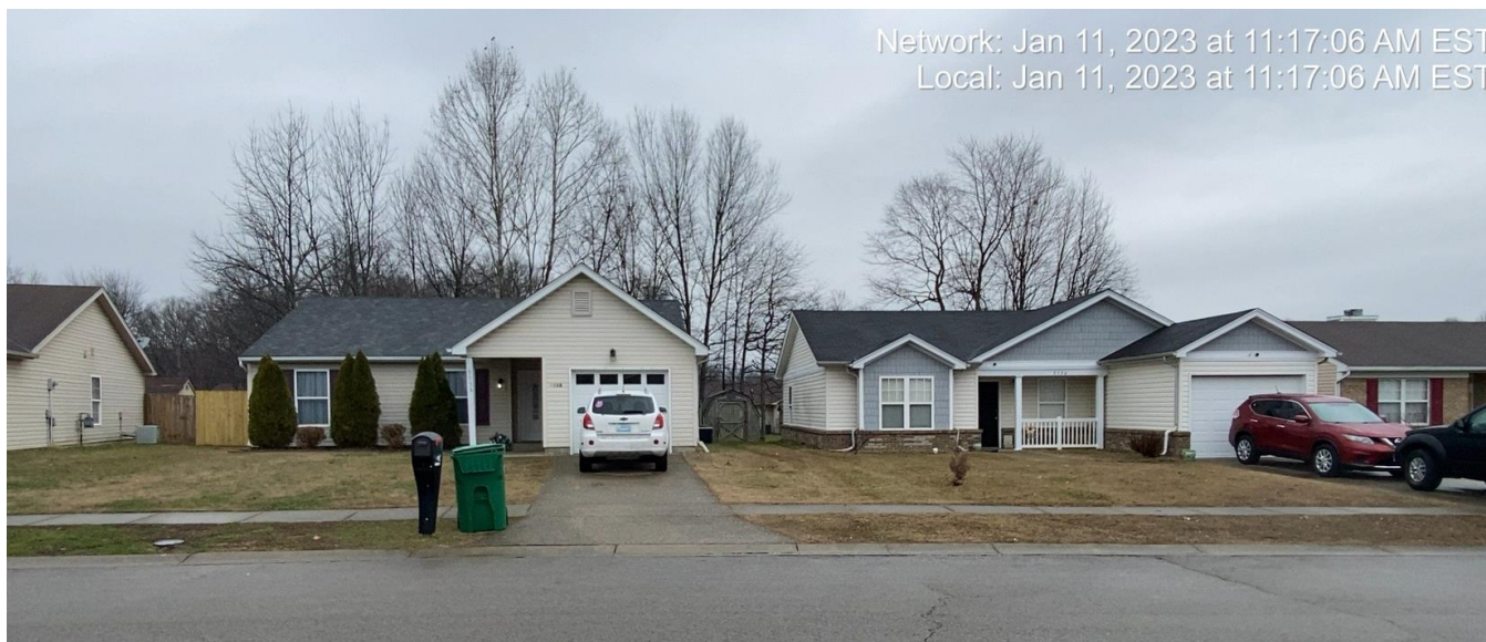
Property to the right.