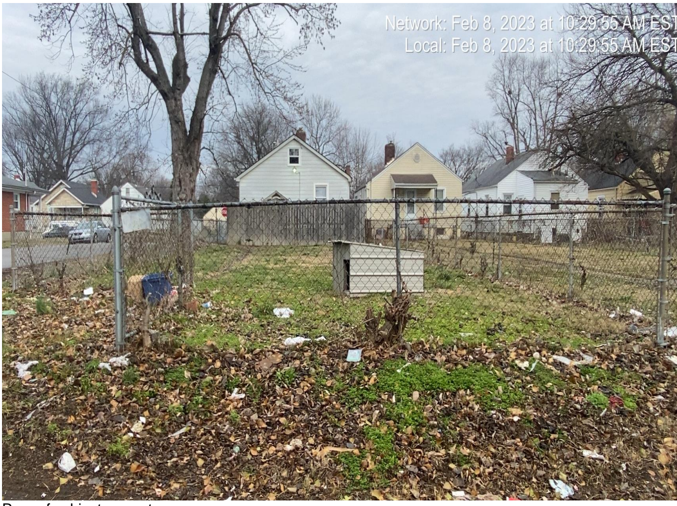
Rear of subject property.