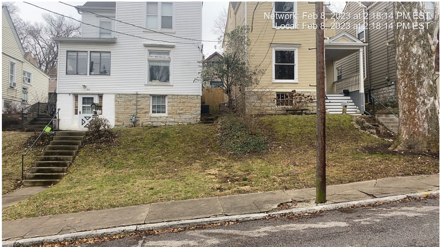
Across street from subject property.