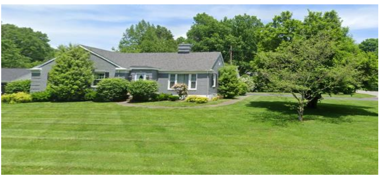
To the left of subject property.