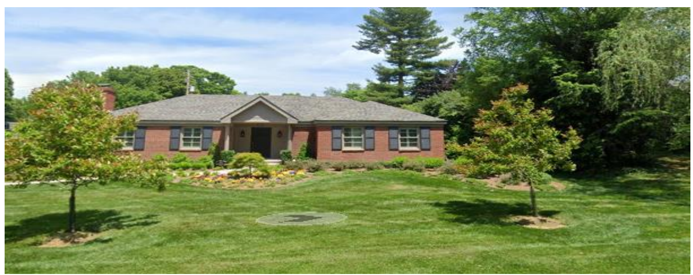
Front of subject property, Google street view, 2021.