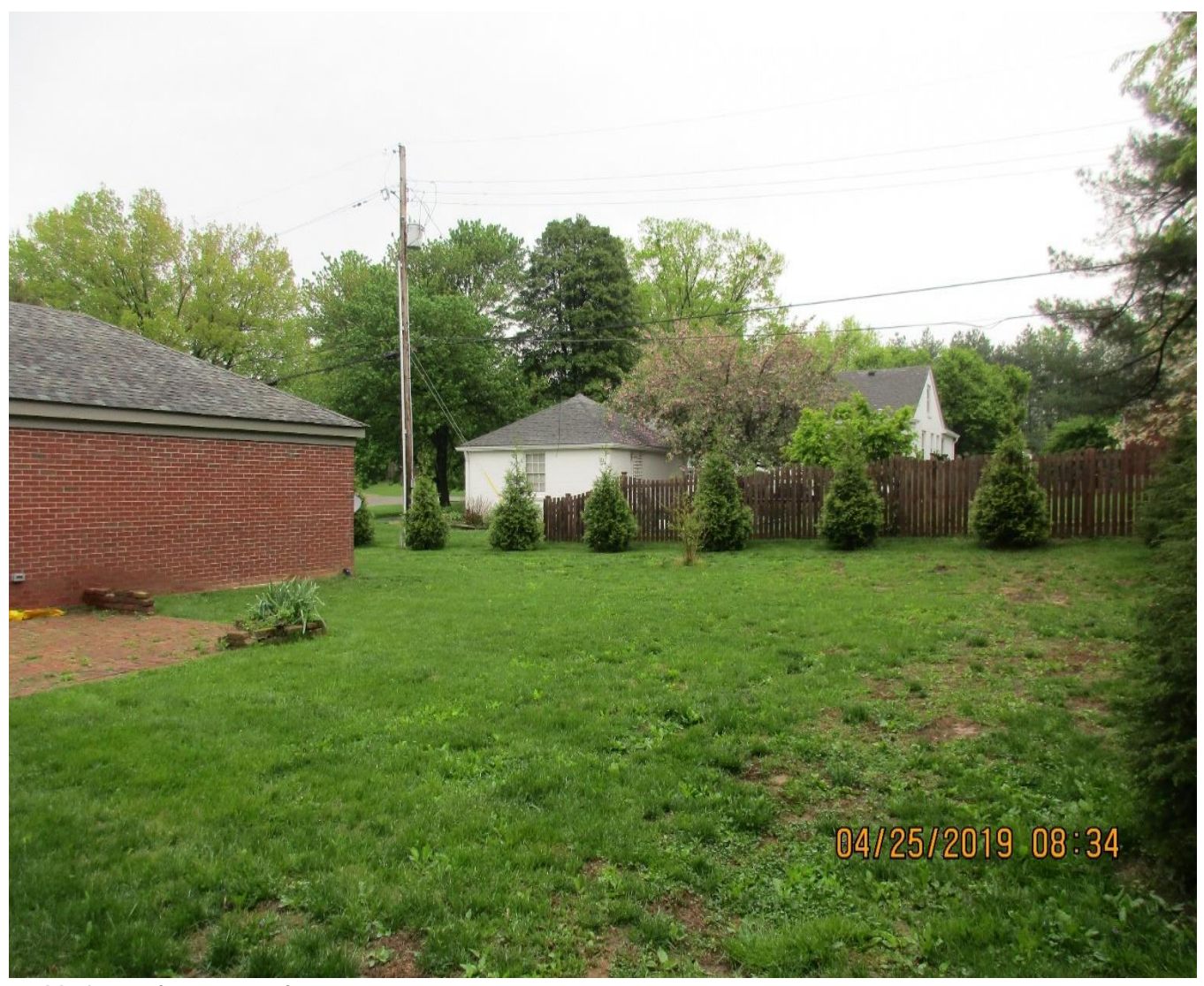
Variance from rear of area.