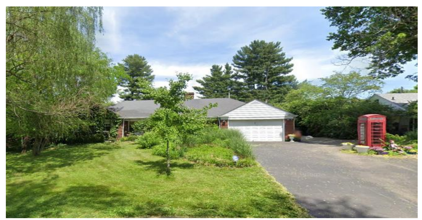
To the right of subject property.