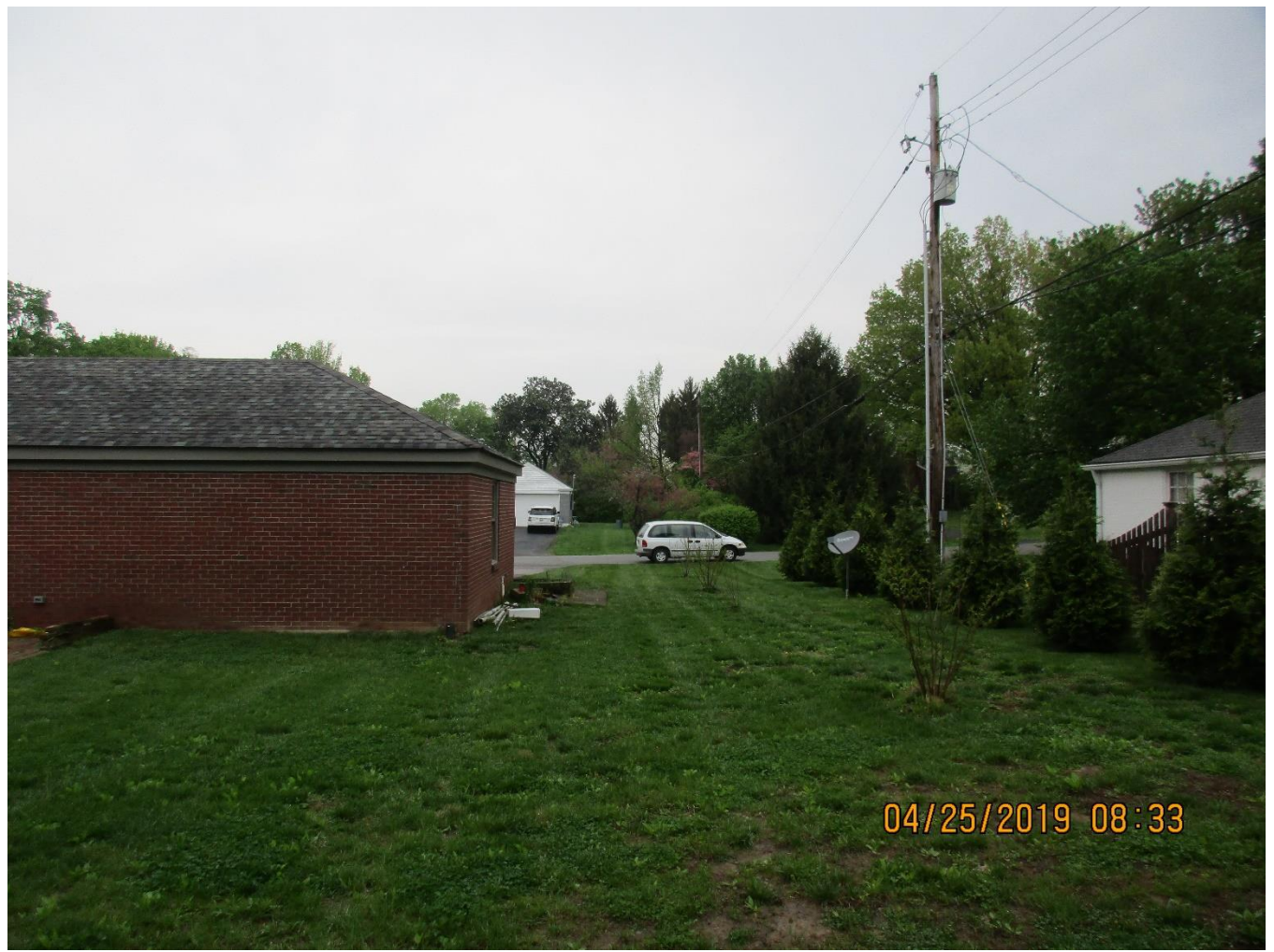
Variance area from Merrifield Road.