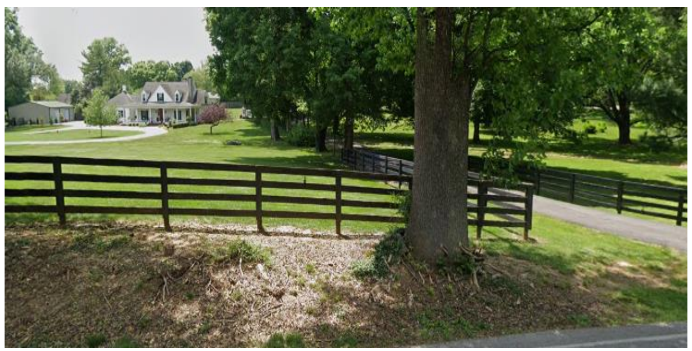
Property across Rudy Lane.