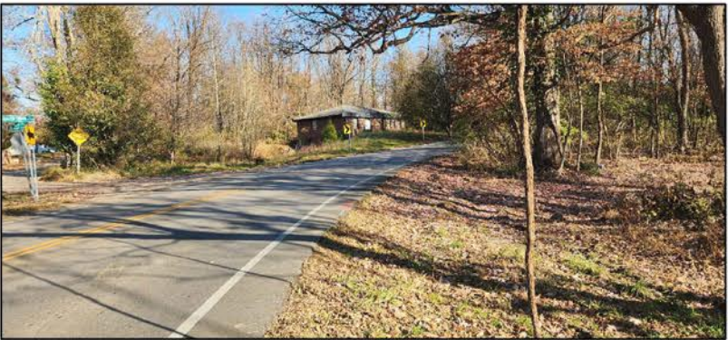
VIEW TOWARDS NORTH N ENGLISH STATION RD

PER TABLE 9-5, APPROACH GRADE CHANGE NORTH OF INTERSECTION DETERMINED TO RESULT IN ADJUSTMENT FACTOR OF 1.0