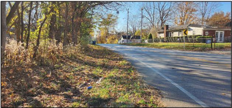
VIEW TOWARDS SOUTH N ENGLISH STATION RD