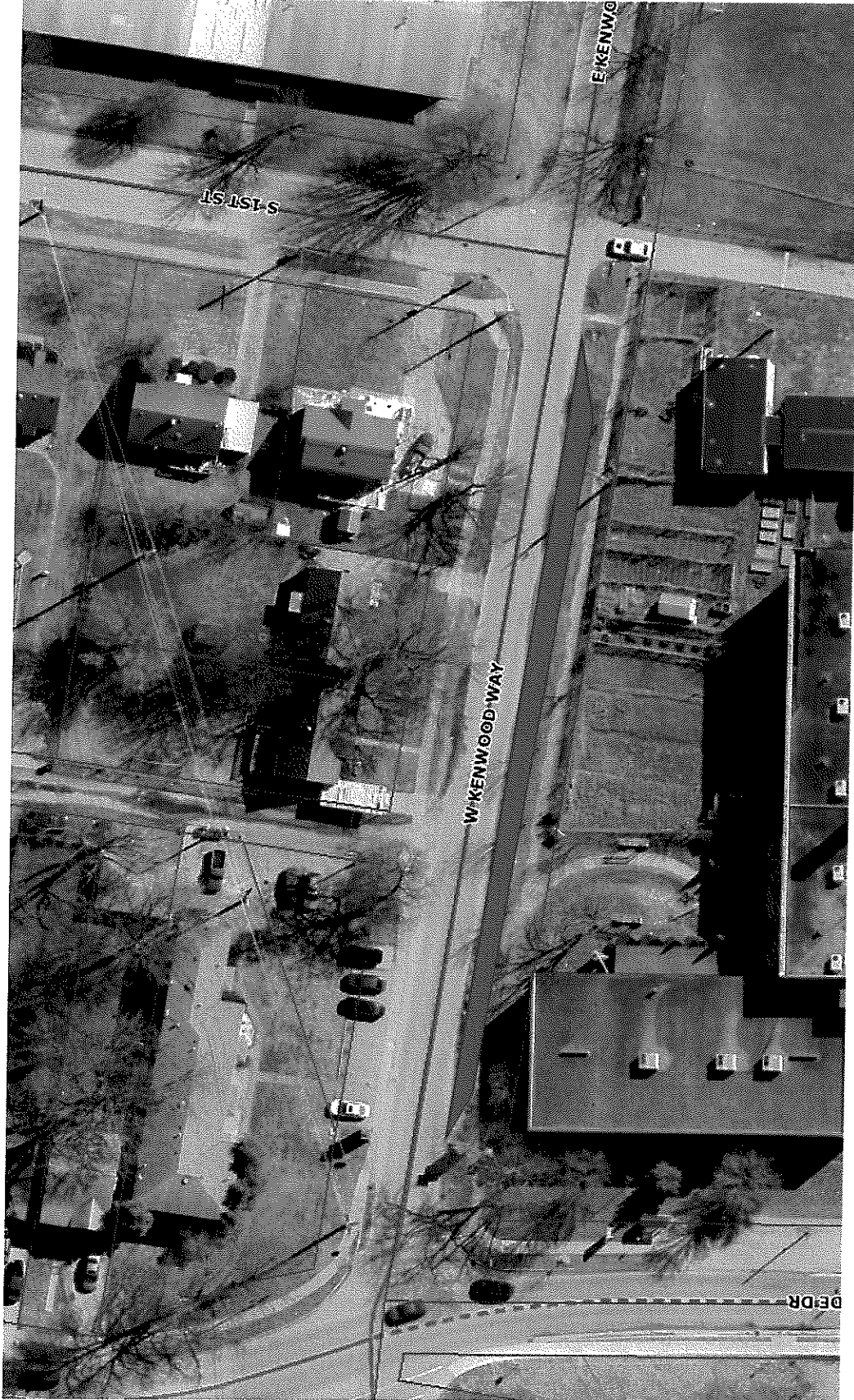
Pave and formalize the on-street parking along W Kenwood Way, about 7' parking lane width, estimated construction ~$30,000