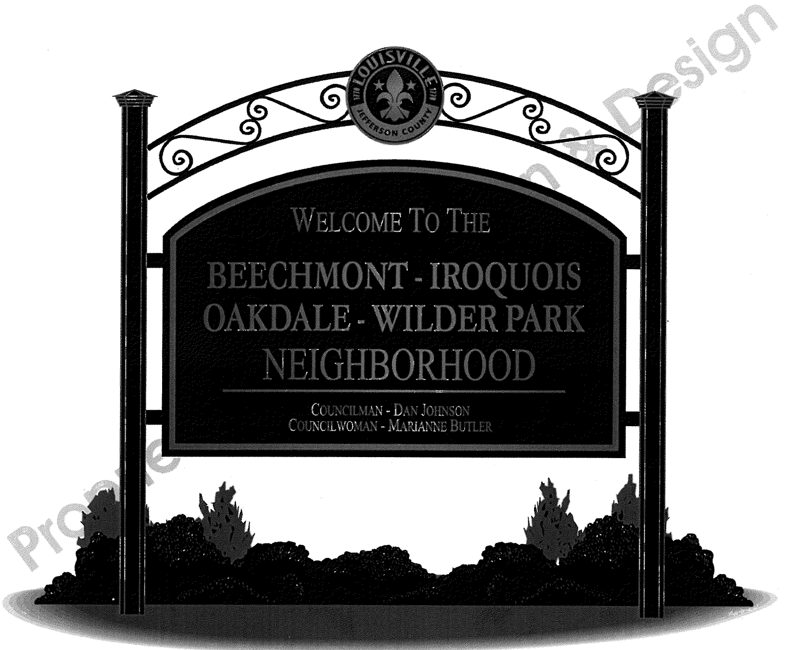
60" x 48" Cast Aluminum Entrance Sign (Changeable Cast Aluminum Name Plates with tamper proof Hardware)

60" x 48" Cast Aluminum Entrance Sign Proof July 22, 2015