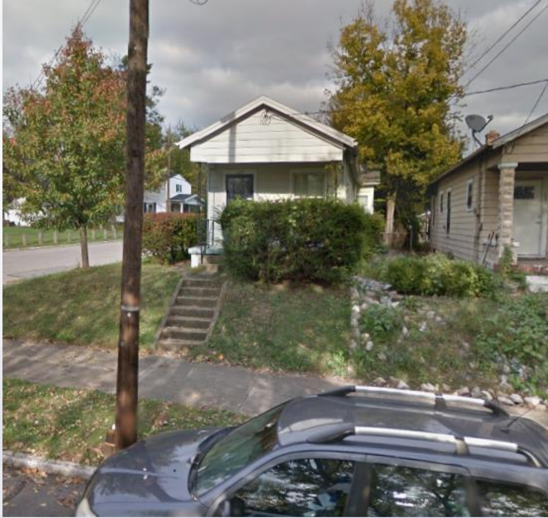
Site Frontage (Charlton St)