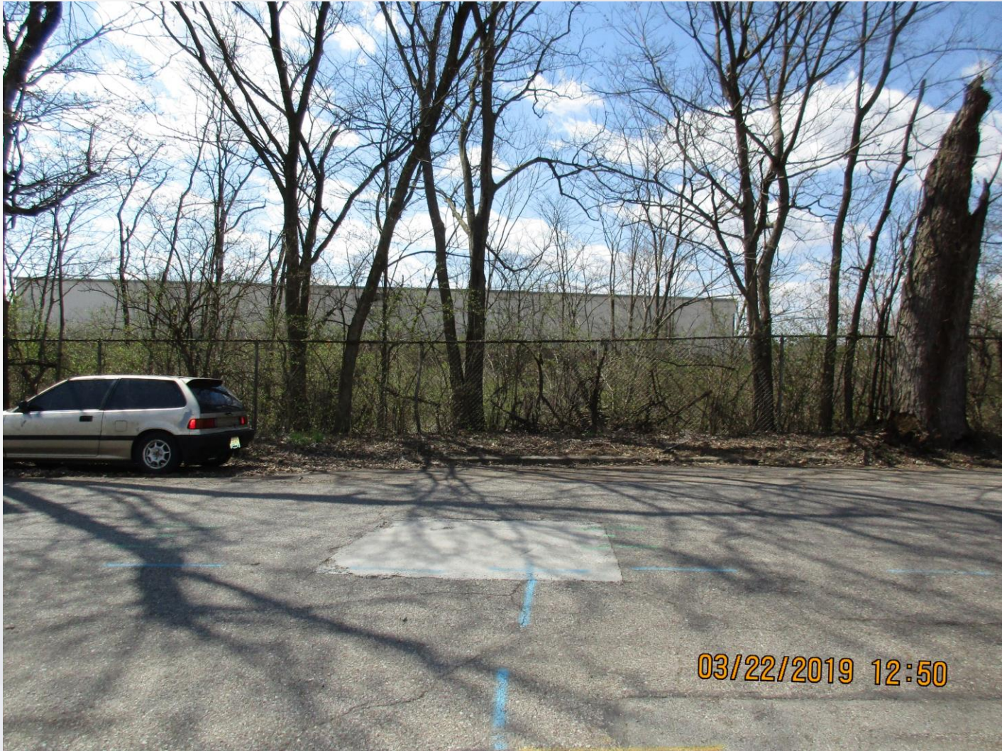
Across to West