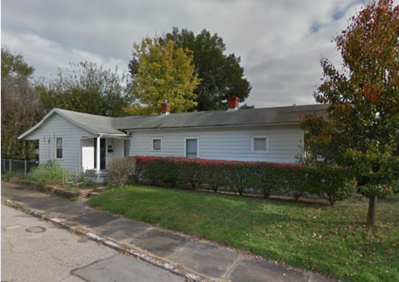
Site Frontage (Arlington Ave)