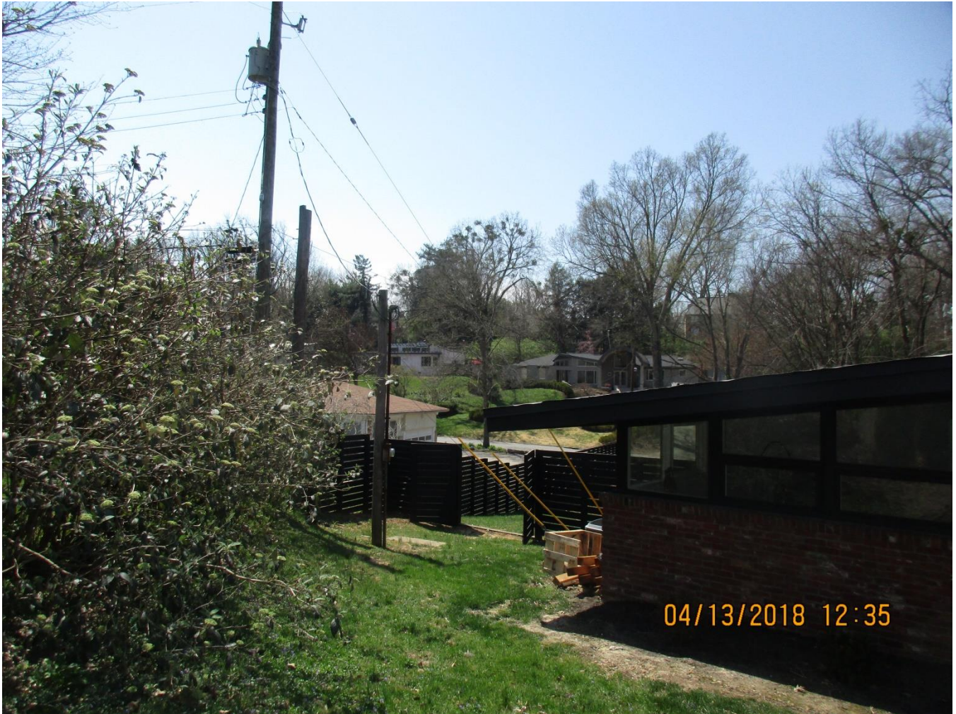
The existing fence.