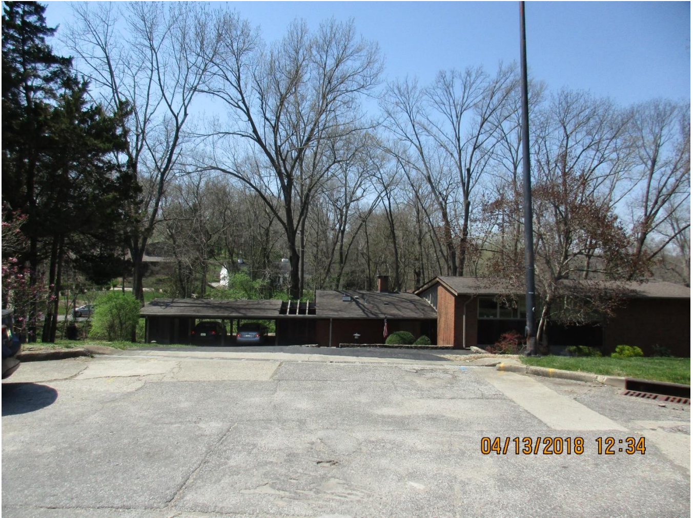
The front of the principal structure and the front yard facing Brookside Drive.