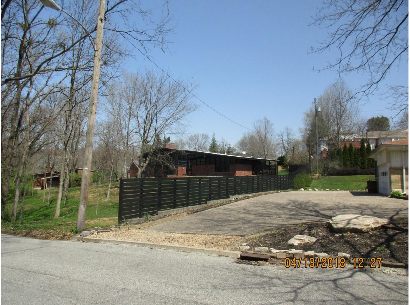
The existing fence.