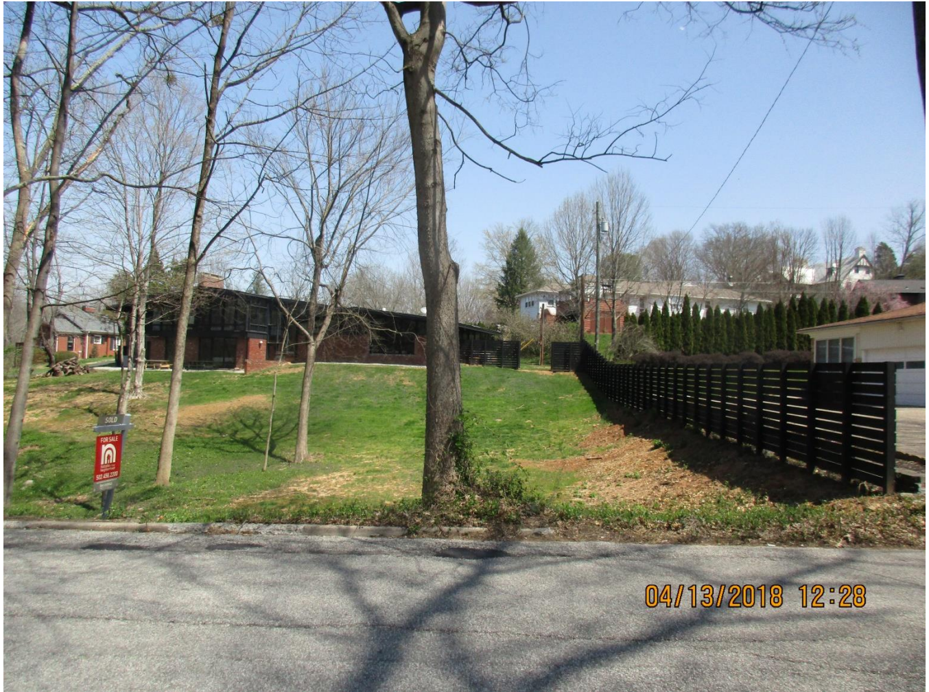
The rear of the principal structure and the front yard facing Valletta Lane.