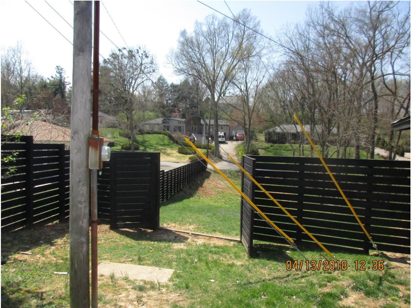
The existing fence.