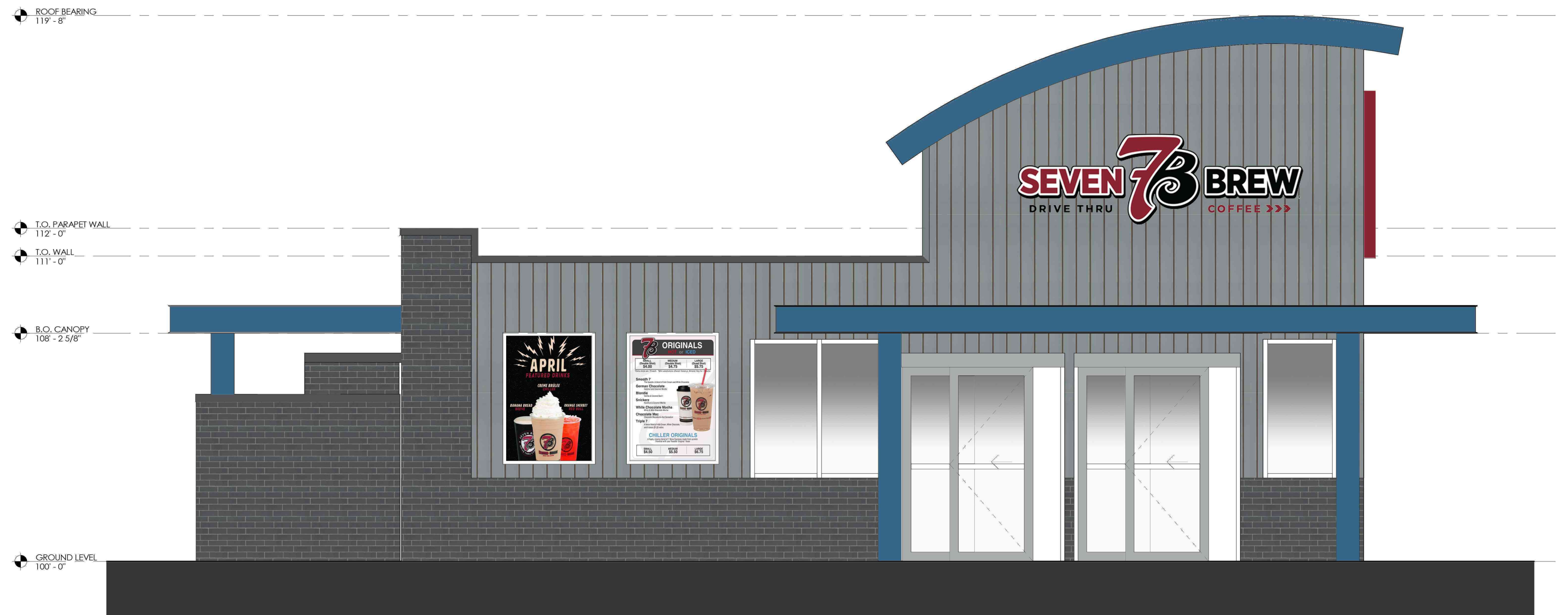
2 EXTERIOR ELEVATION - LEFT SIDE - SOUTH 3/8" = 1'-0"