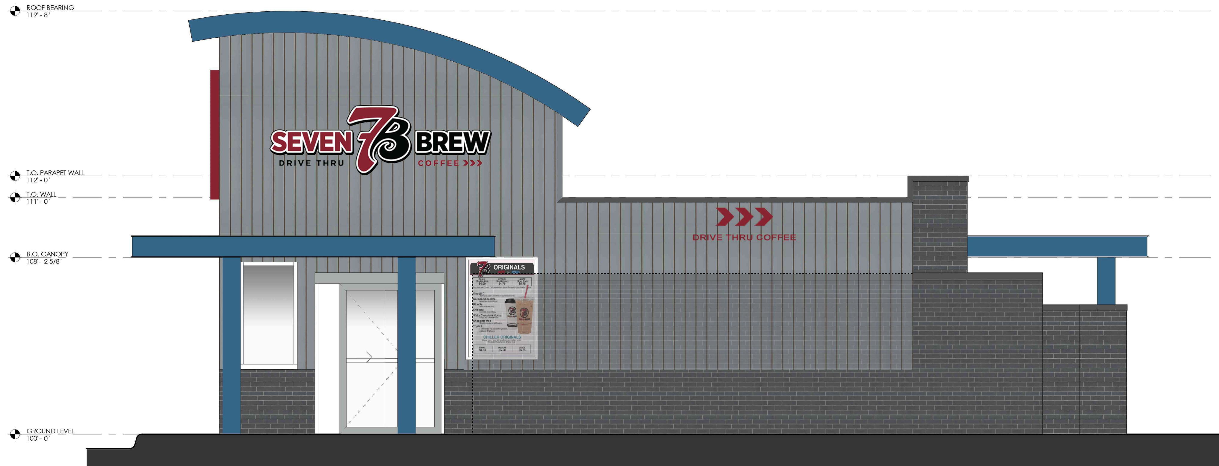
1 EXTERIOR ELEVATION - RIGHT SIDE - NORTH 3/8" = 1'-0"