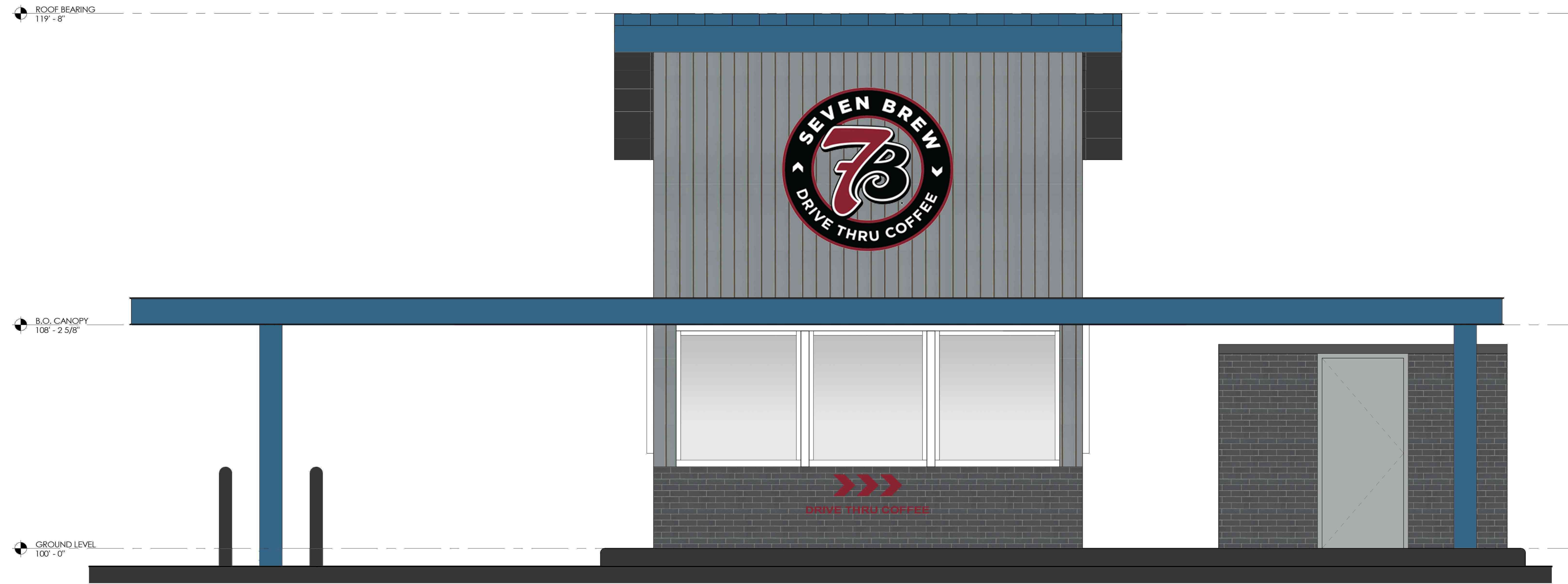
1 EXTERIOR ELEVATION - FRONT - EAST 3/8" = 1'-0"