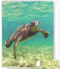
"Hawaiian Green Sea Turtle"