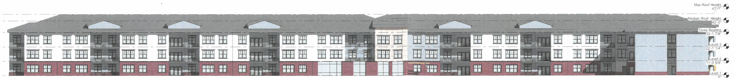
1 Elevation - Type A - Front A201 1/16" = 1'-0"