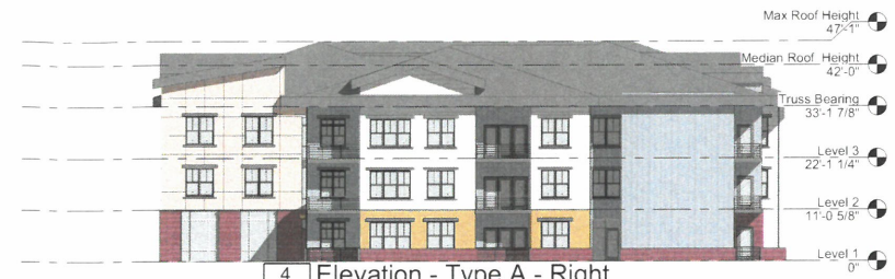
4 Elevation - Type A - Right A201 1/16" = 1'-0"