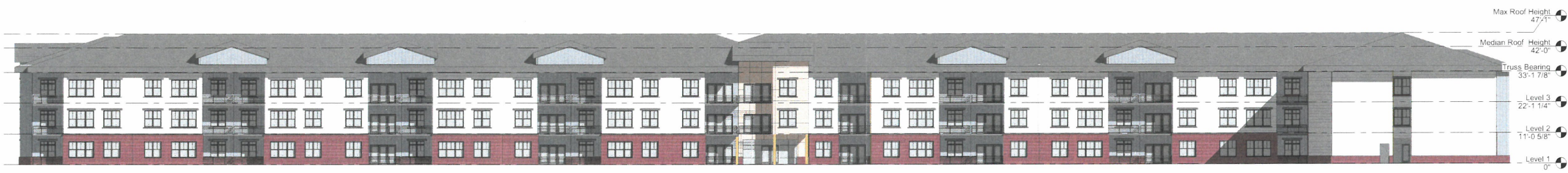
2 Elevation - Type A - Rear A201 1/16" = 1'-0"