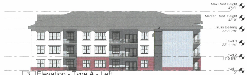
3 Elevation - Type A - Left A201 1/16" = 1'-0"