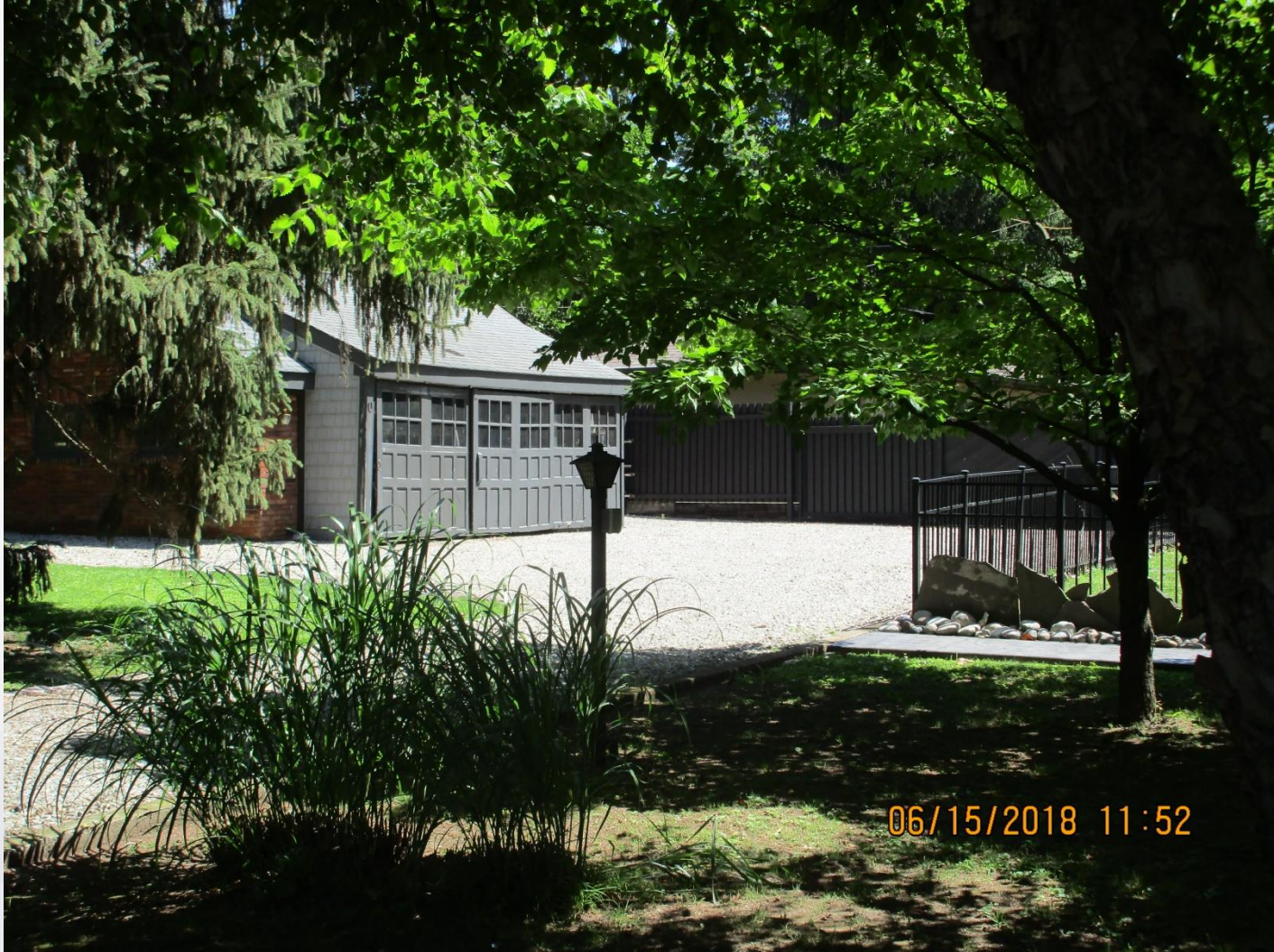
Side Driveway and Parking Area