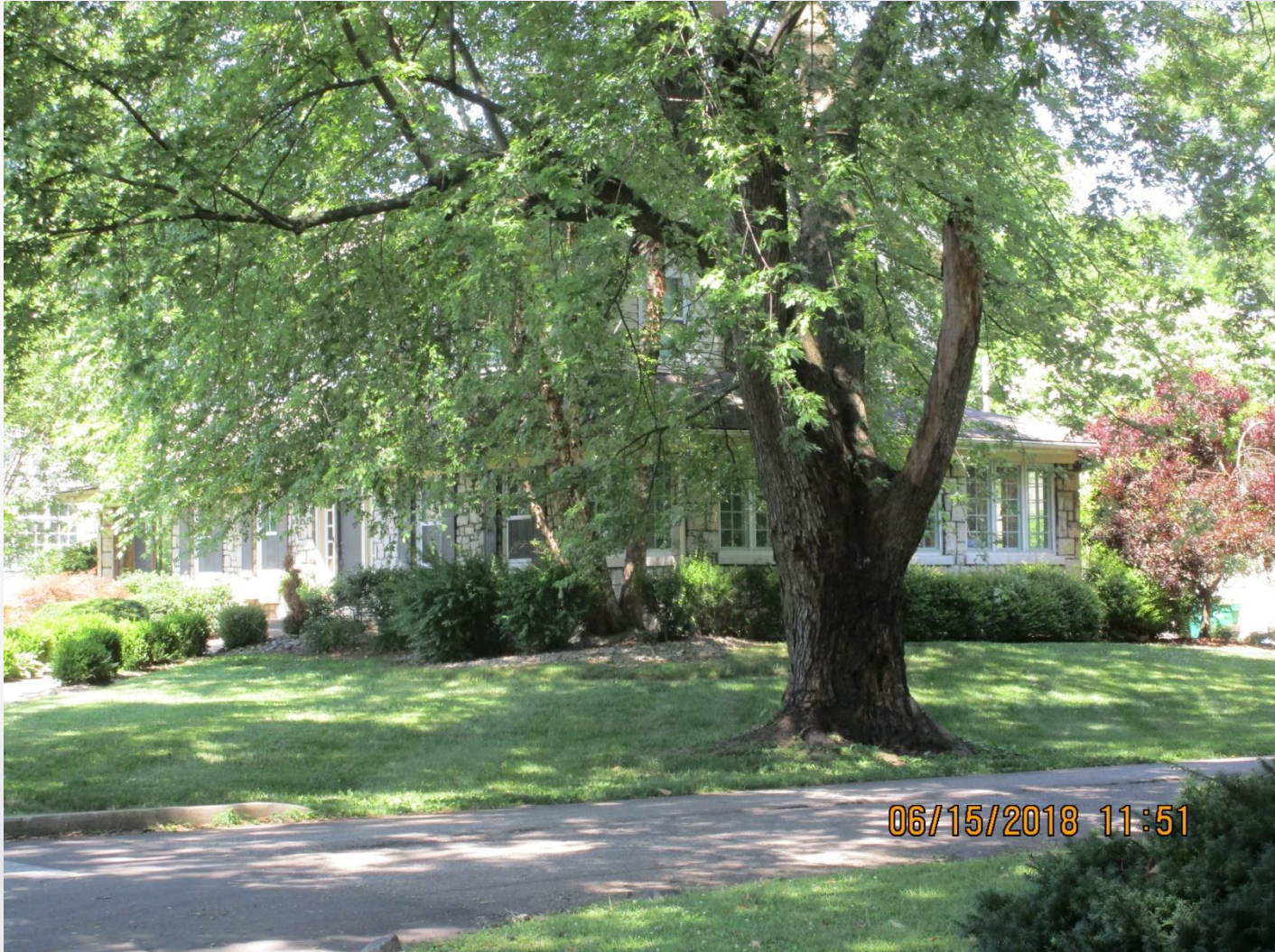
Adjacent to West