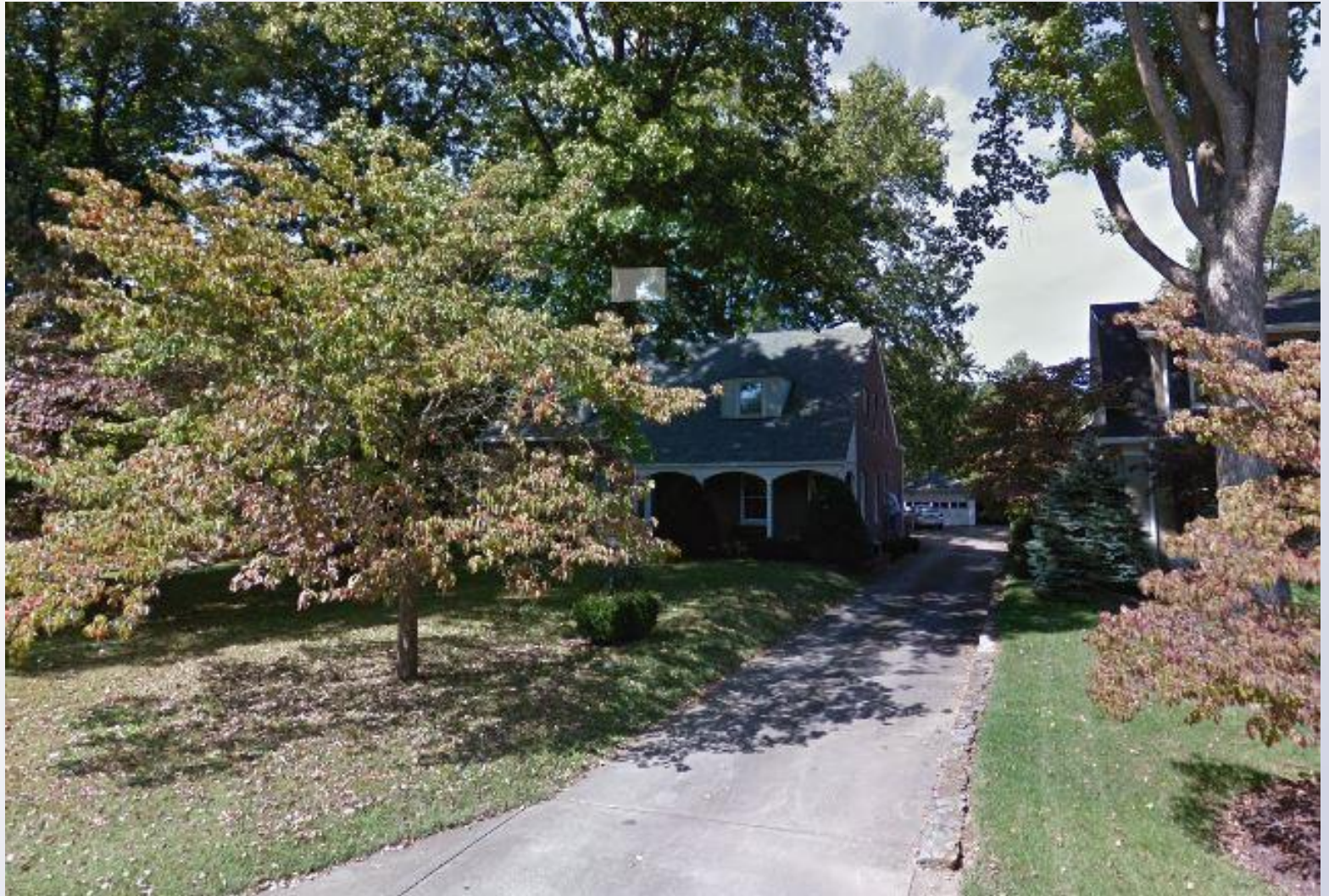
Adjacent to East