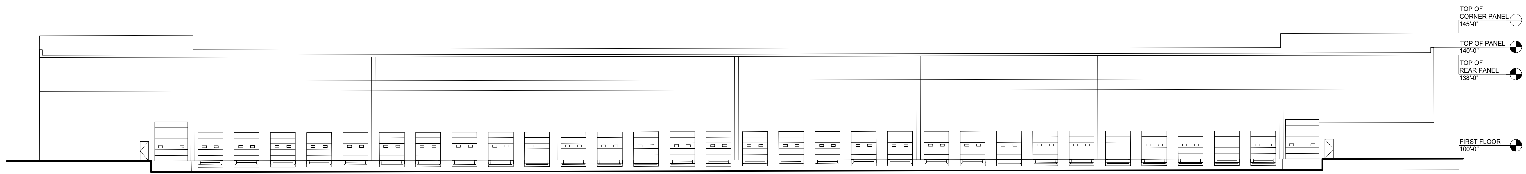
SOUTH ELEVATION SCALE: 1" = 20'