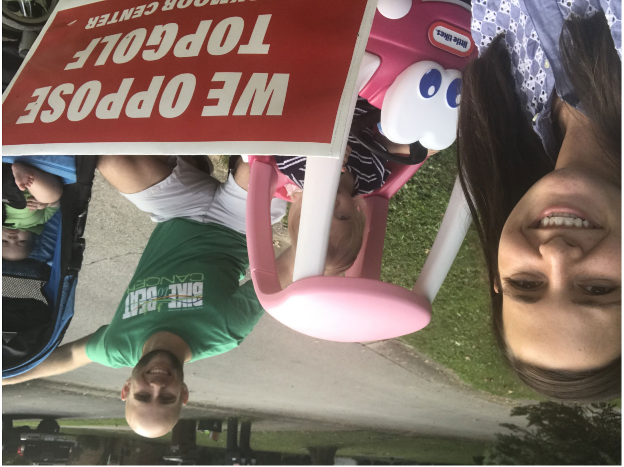
Shot from my iPhone