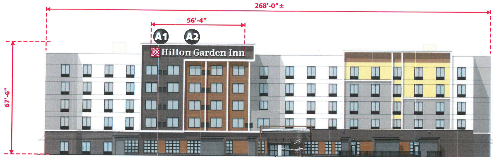
PROPOSED NEW SOUTH ELEVATION

RECEIVED MAY 31 2017 PLANNING & DESIGN SERVICES