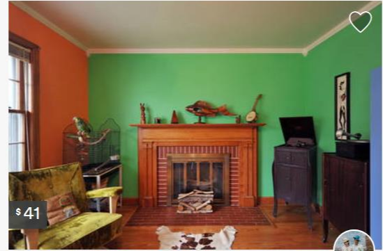
$41 Stay with a Ukulele musician! Private room - 102 reviews