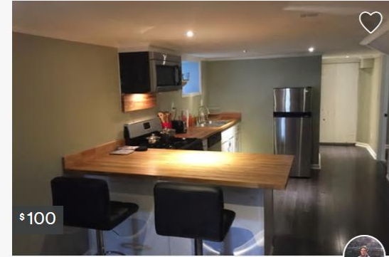
$100 Apartment in The Highlands Entire home/apt - 21 reviews

Additional fees apply. Taxes may be added.