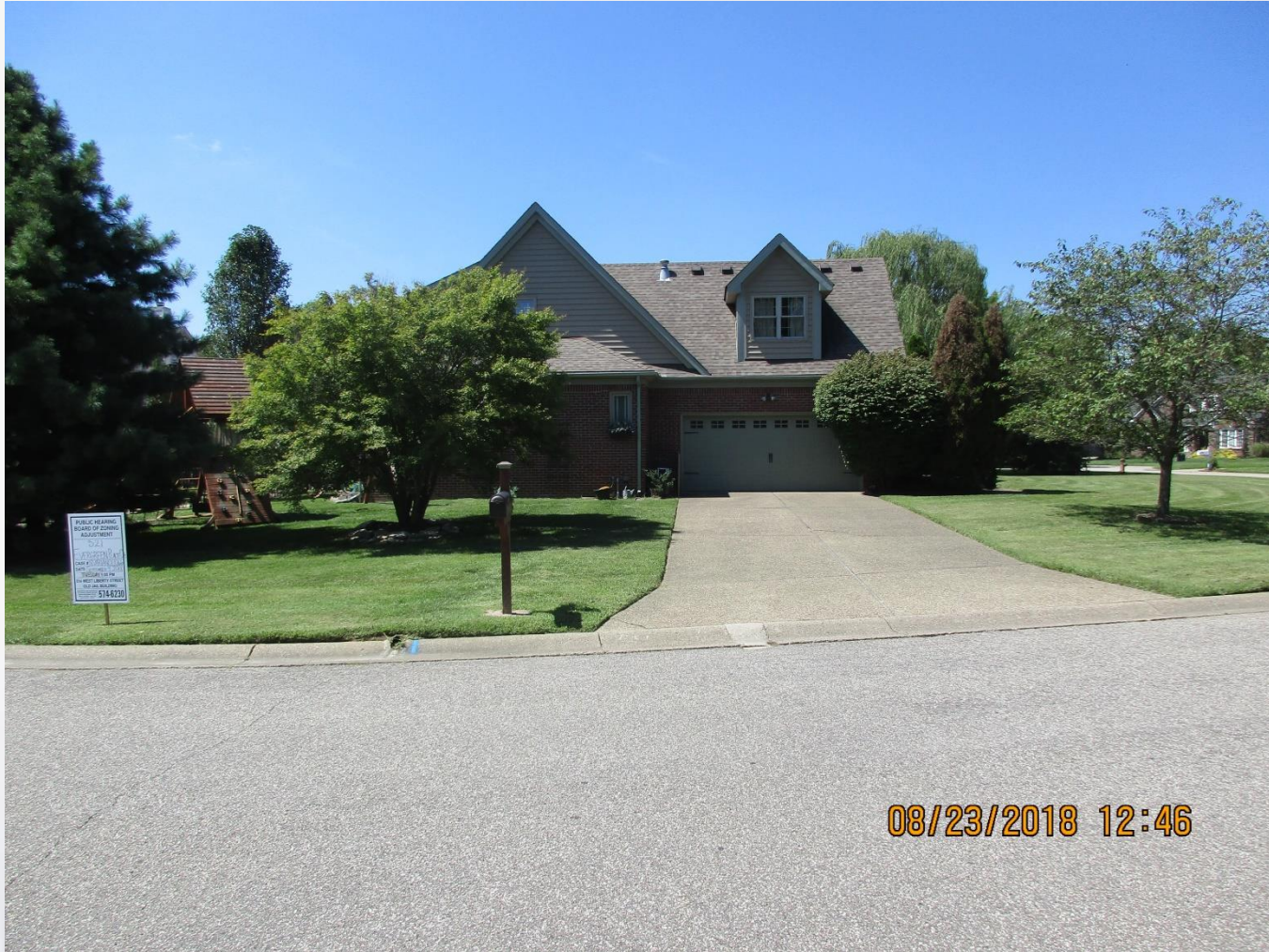
Side of property from Evergreen Place Court.