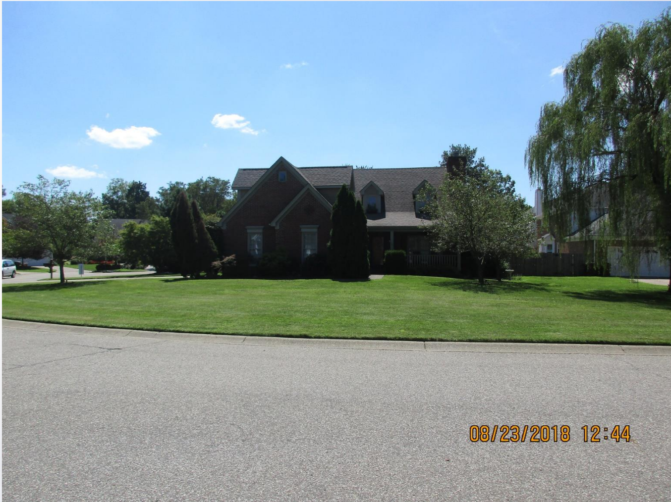
The front of the subject property.