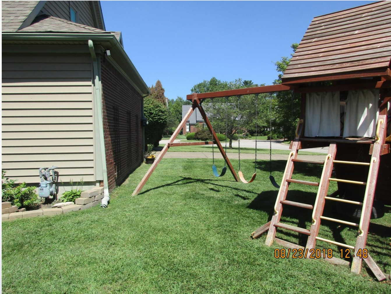
Area of proposed garage addition looking north.