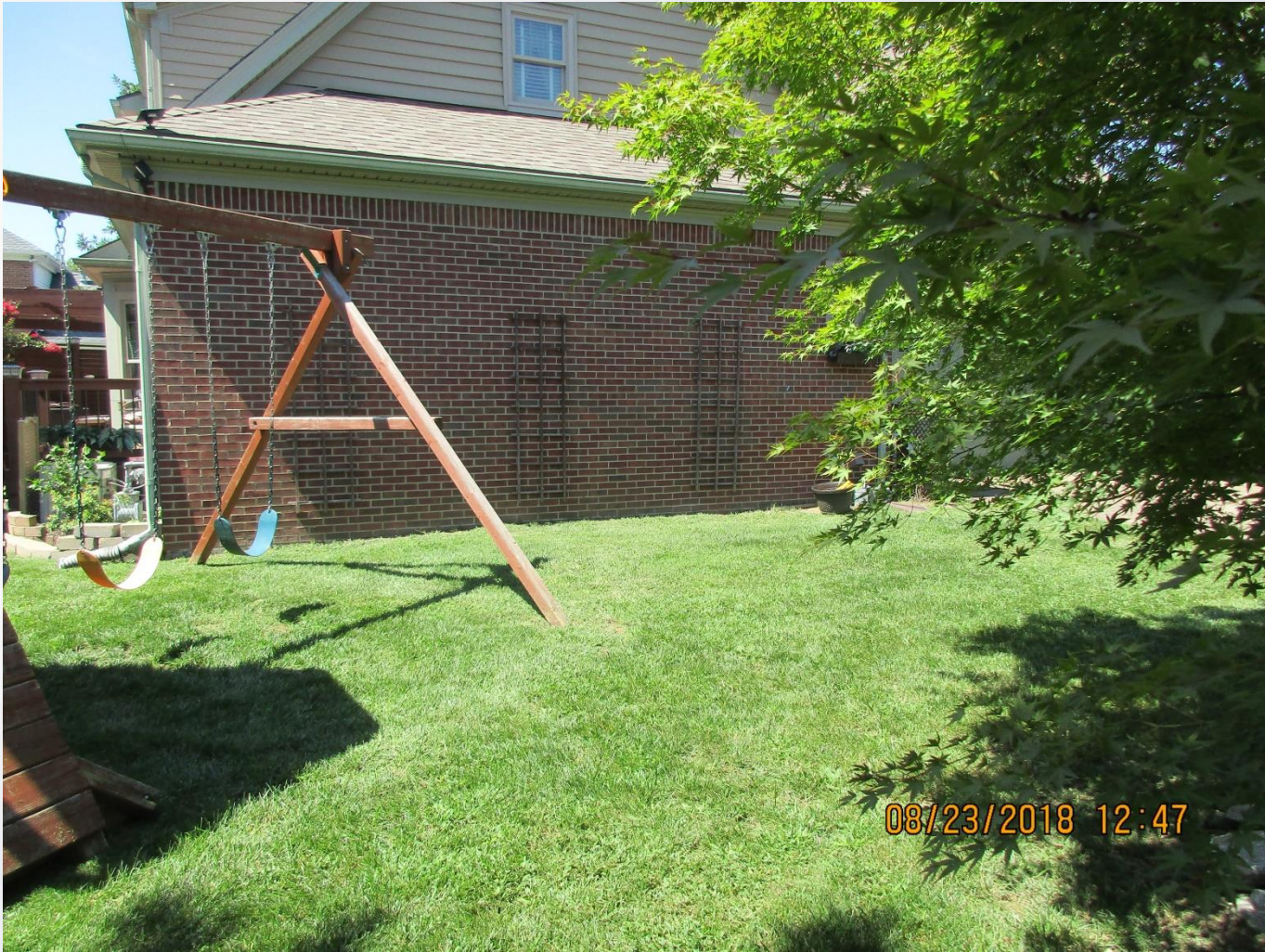
Area of proposed garage addition looking west.