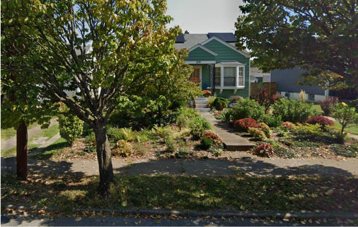
To the right of the subject property.