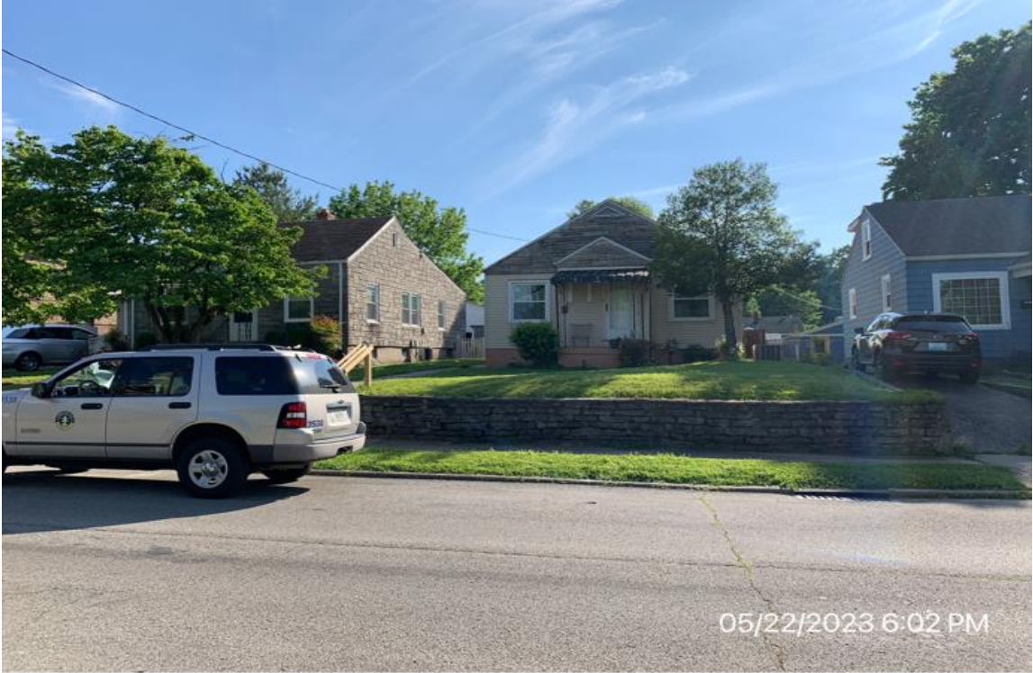
Across the street from subject property.