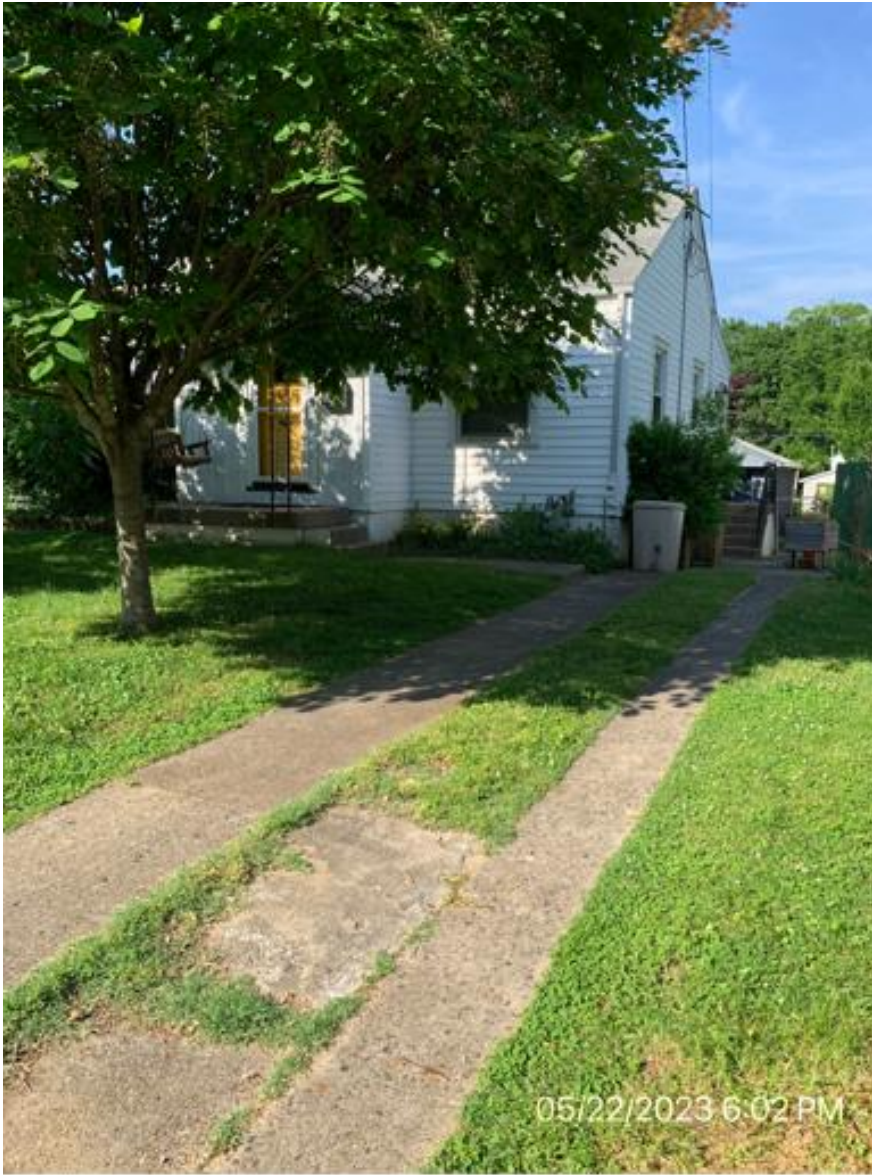
Front of subject property.