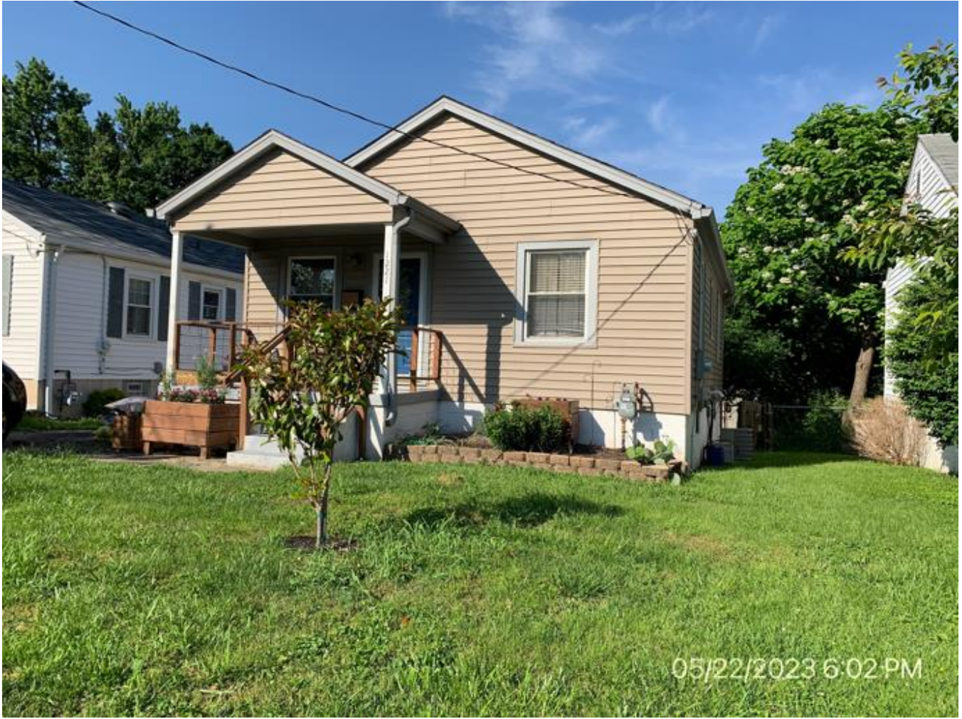
Left of subject property.