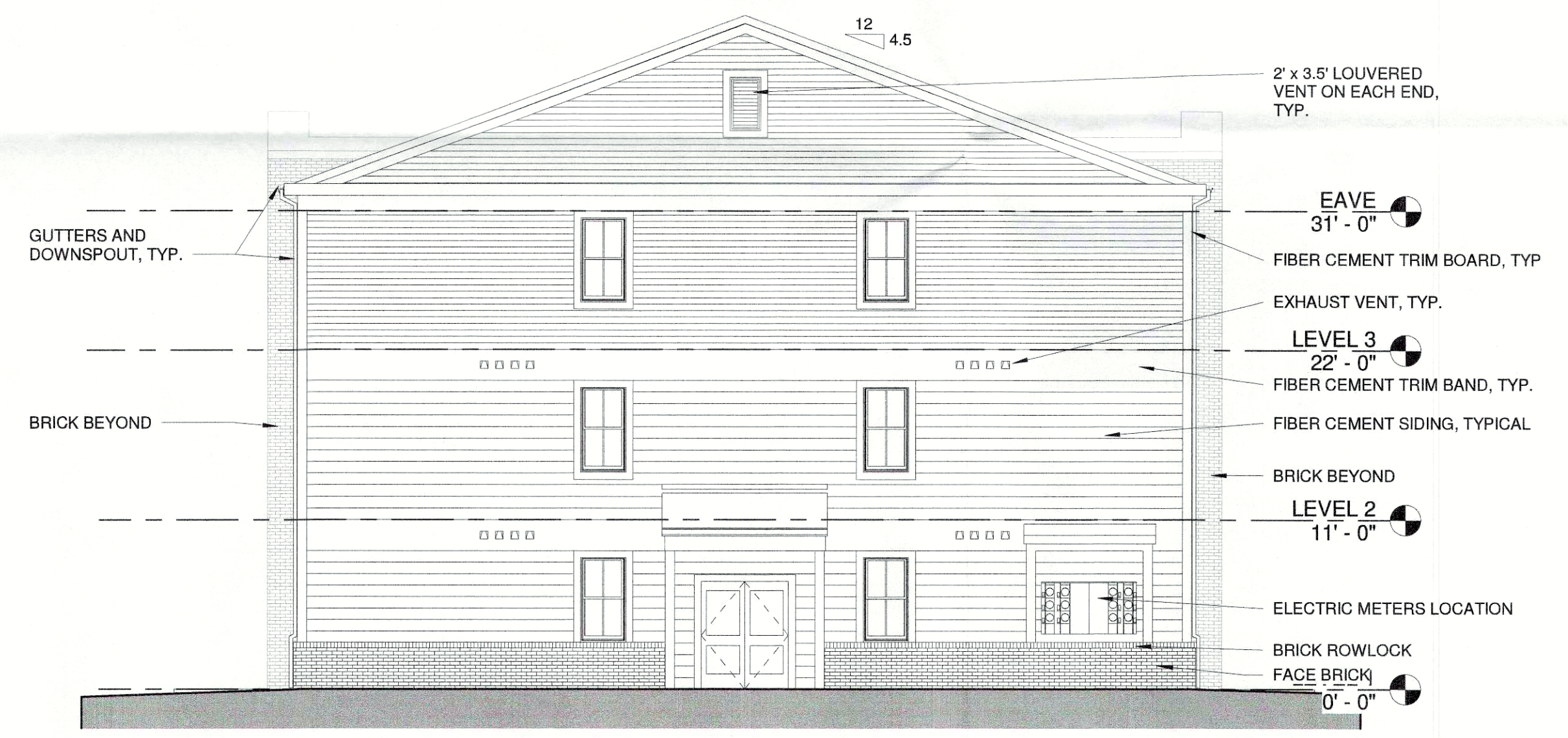
RIGHT ELEVATION BUILDING "A" & "B"