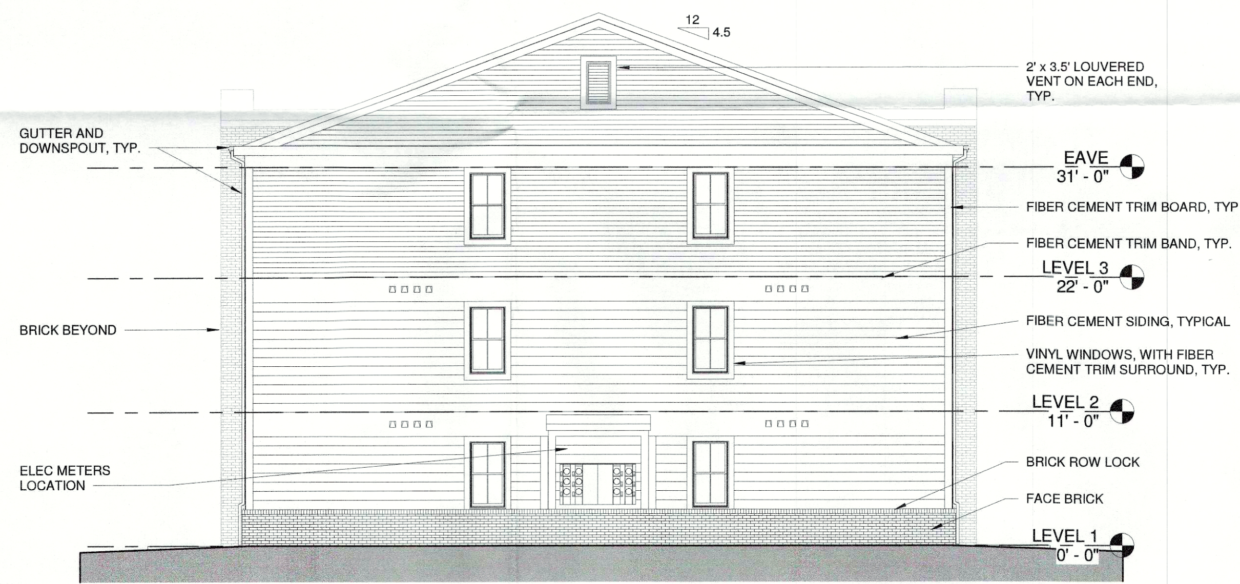
LEFT ELEVATION BUILDING "A" & "B"