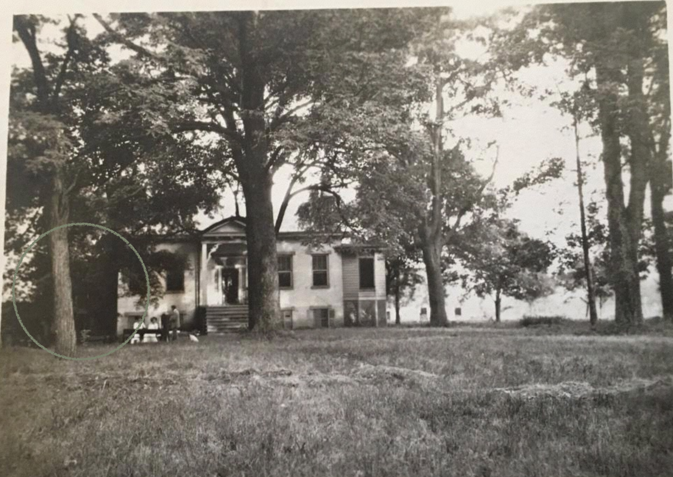
at "Calorama" near Louisville, Ky. - July 16, 1911