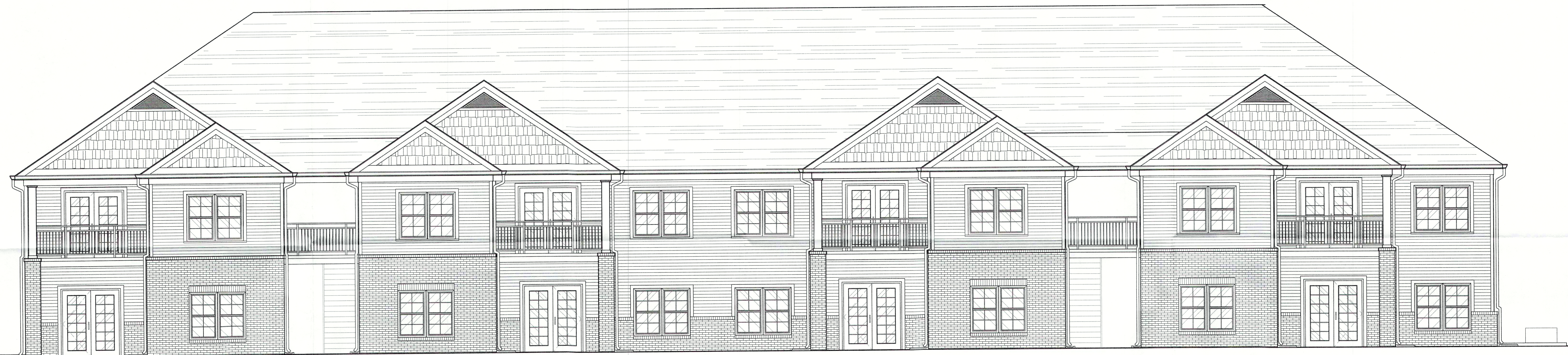
BUILDING TYPE A1 (16-PLEX) REAR ELEVATION