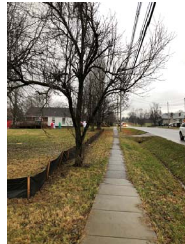
Smyrna Road Sidewalk