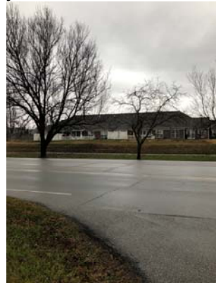
Property across Smyrna Pky.