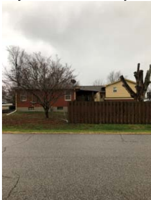
Property across Bay Pine