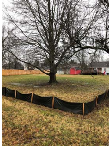
Subject site from corner