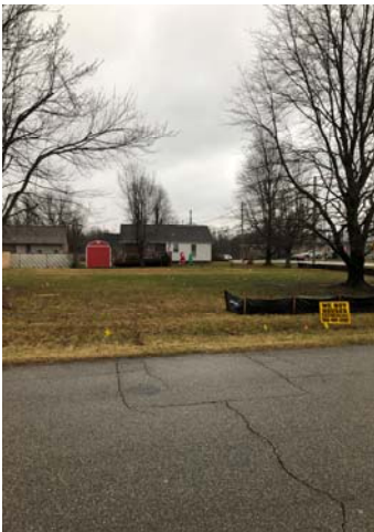
Subject site from Bay Pine