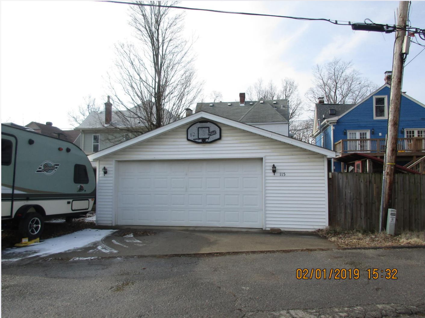
Adjacent to Rear