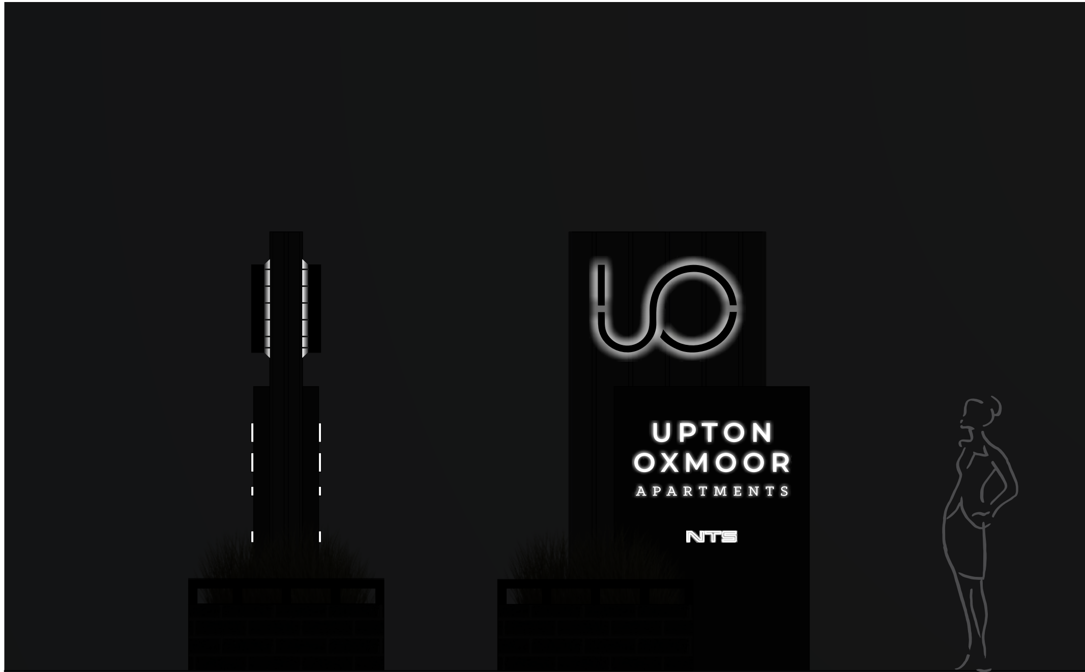
Main ID - 1 Monument Sign - A Qty: 01 Illuminated Night View