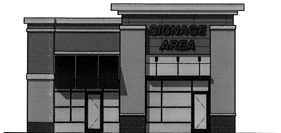
SOUTH ELEVATION (SHELBYVILLE ROAD)