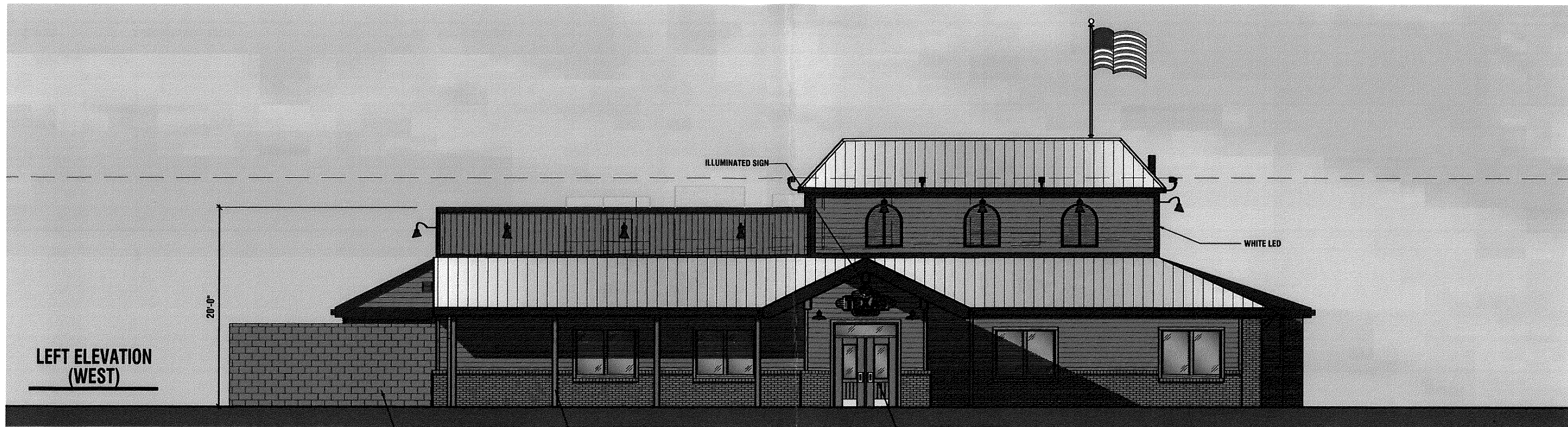
LEFT ELEVATION (WEST)