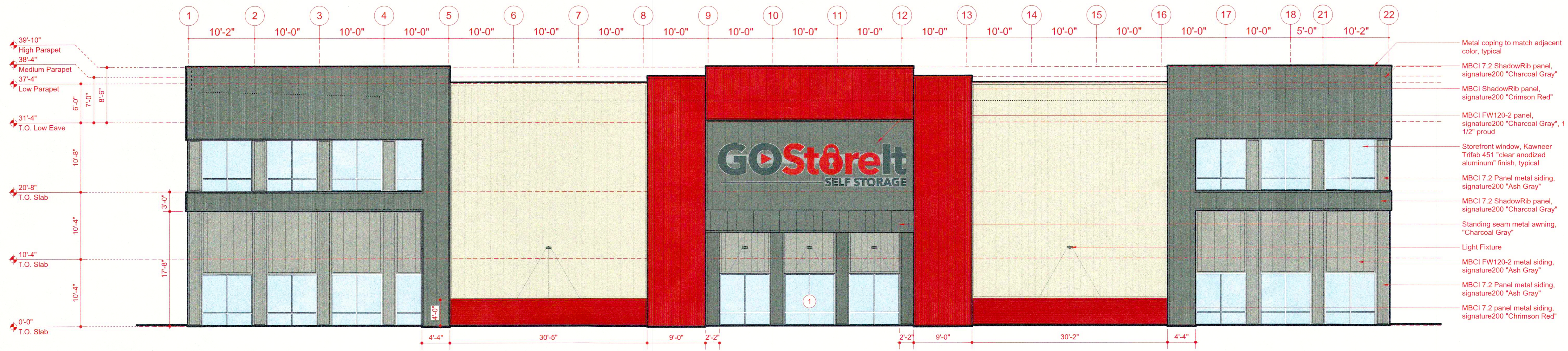
WEST ELEVATION A2.15 1/8"