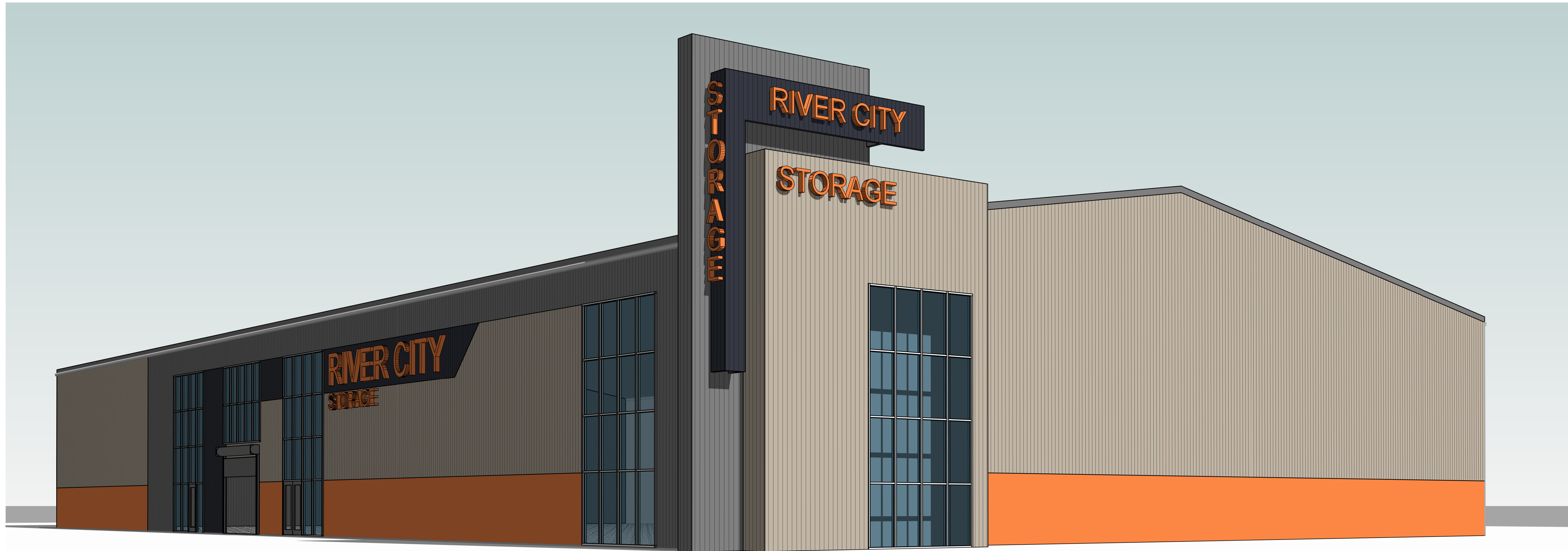
1 Option One 3D View 1