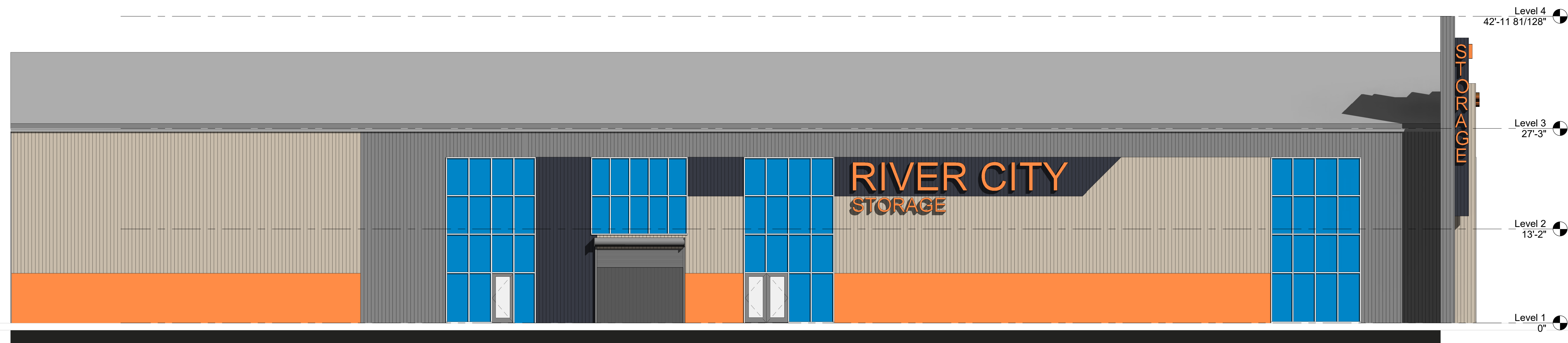
2 Option 3 South A201 1/8" = 1'-0"