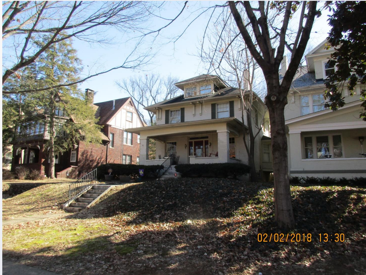
Adjoining Property to East