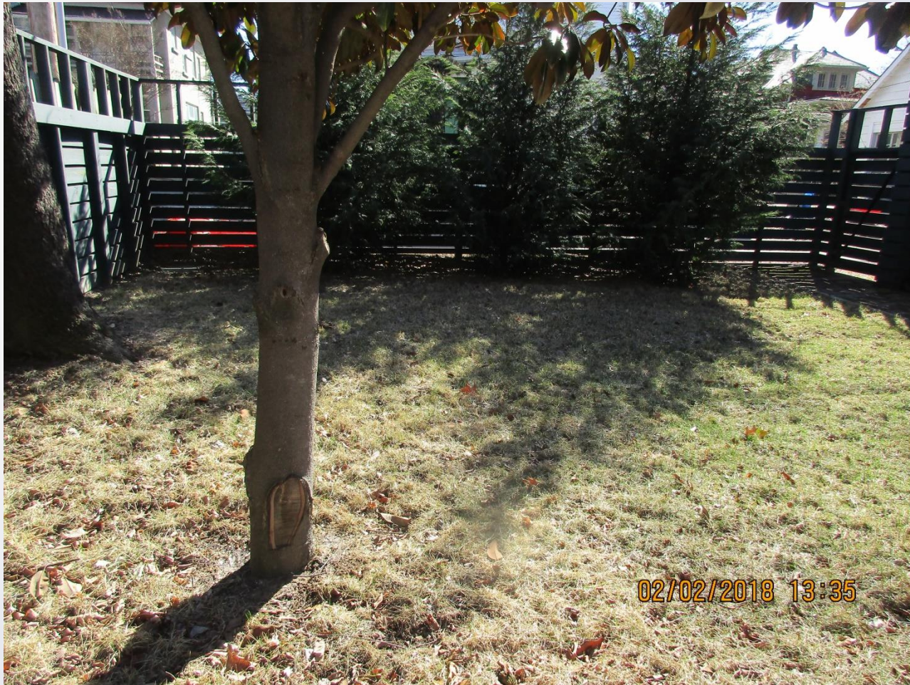
East to West Along Rear Property Line