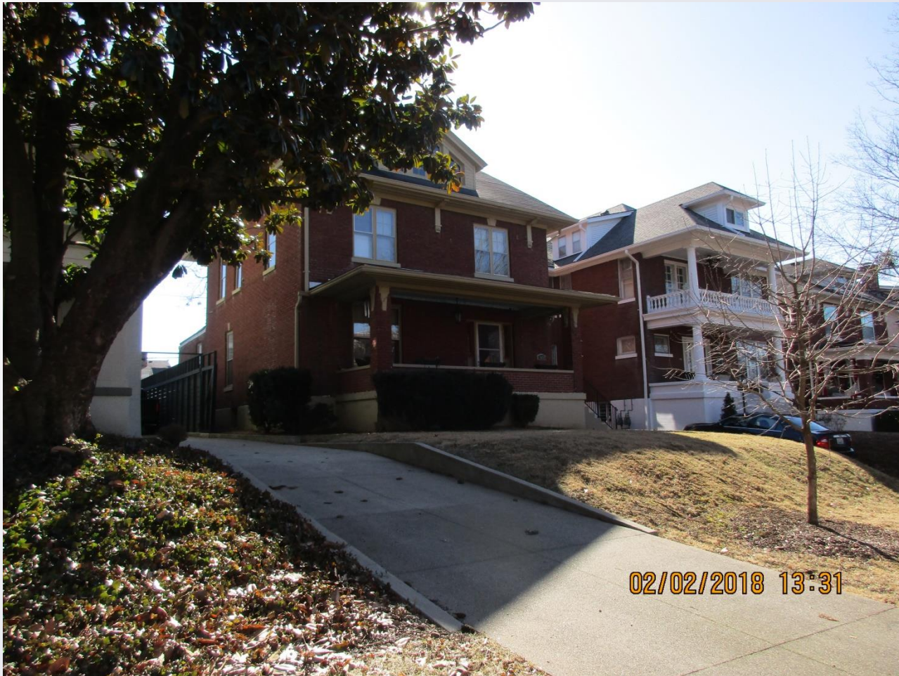
Adjoining Property to West