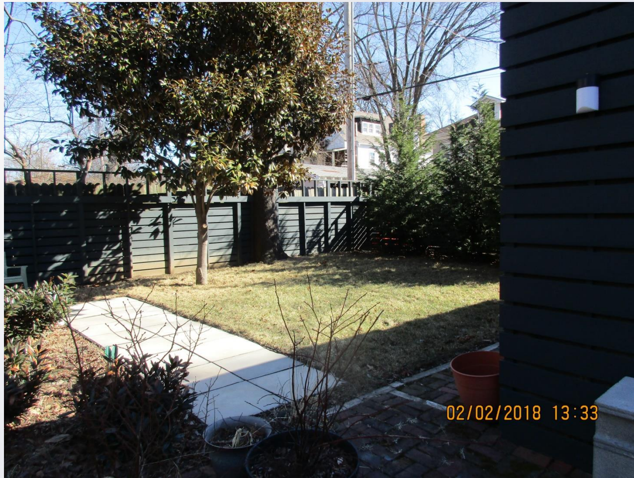
From Deck to Rear Property Line