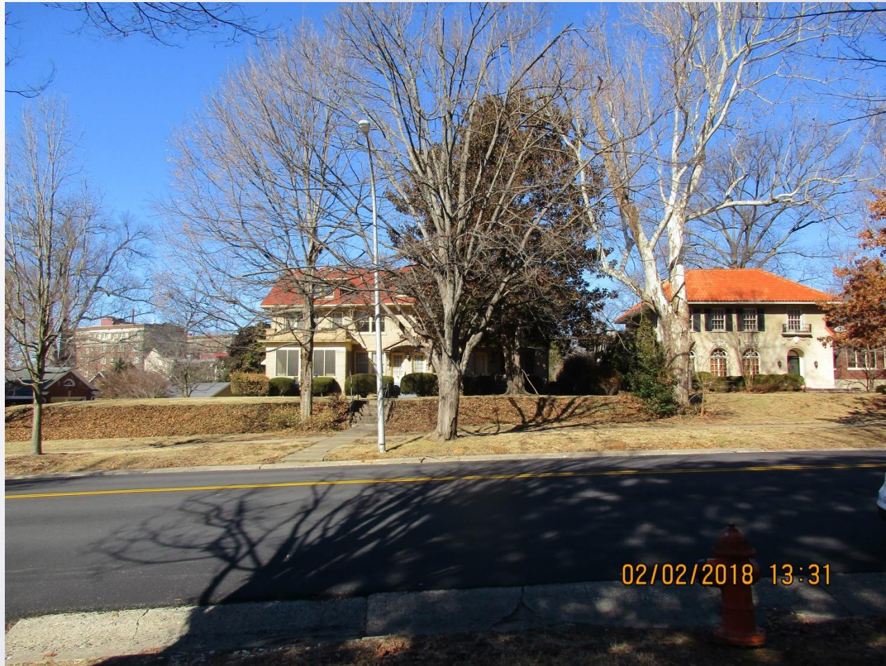
Adjoining Property to North