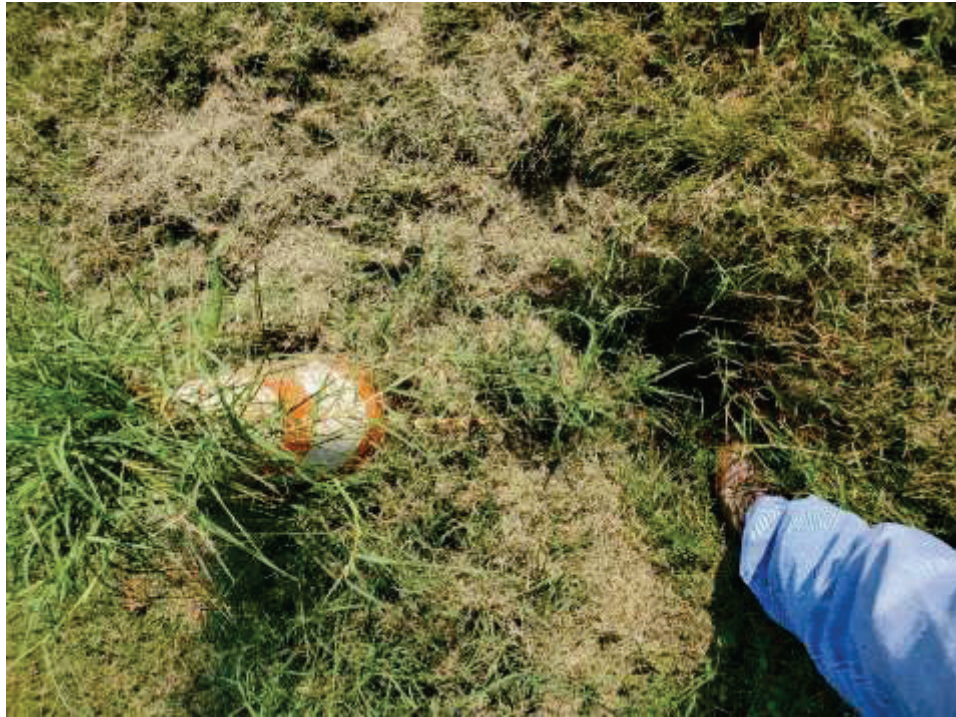
Sinkhole present in Ballfield