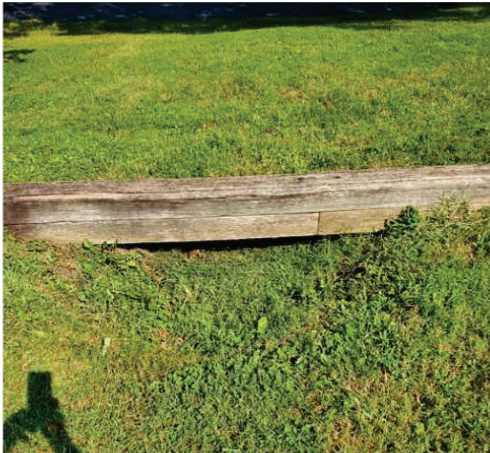
Depression present at Edge of Playground