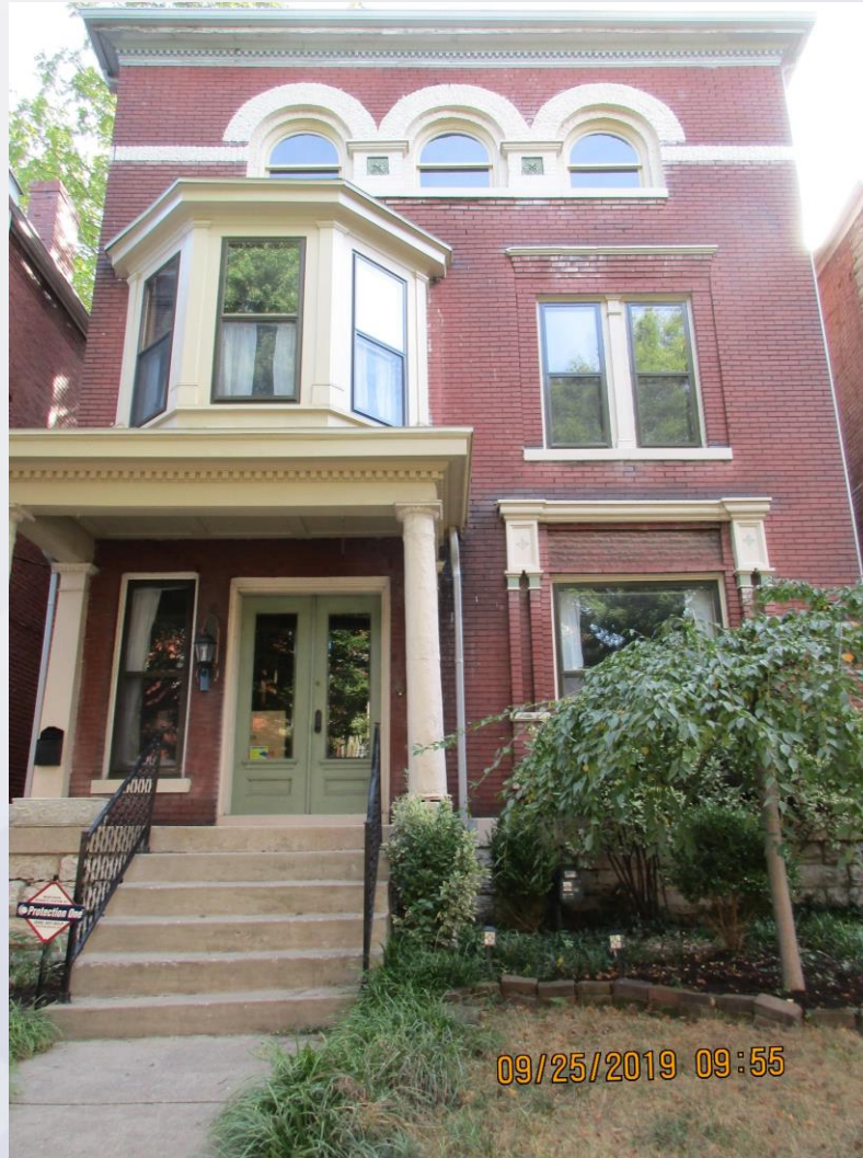
Adjacent to South