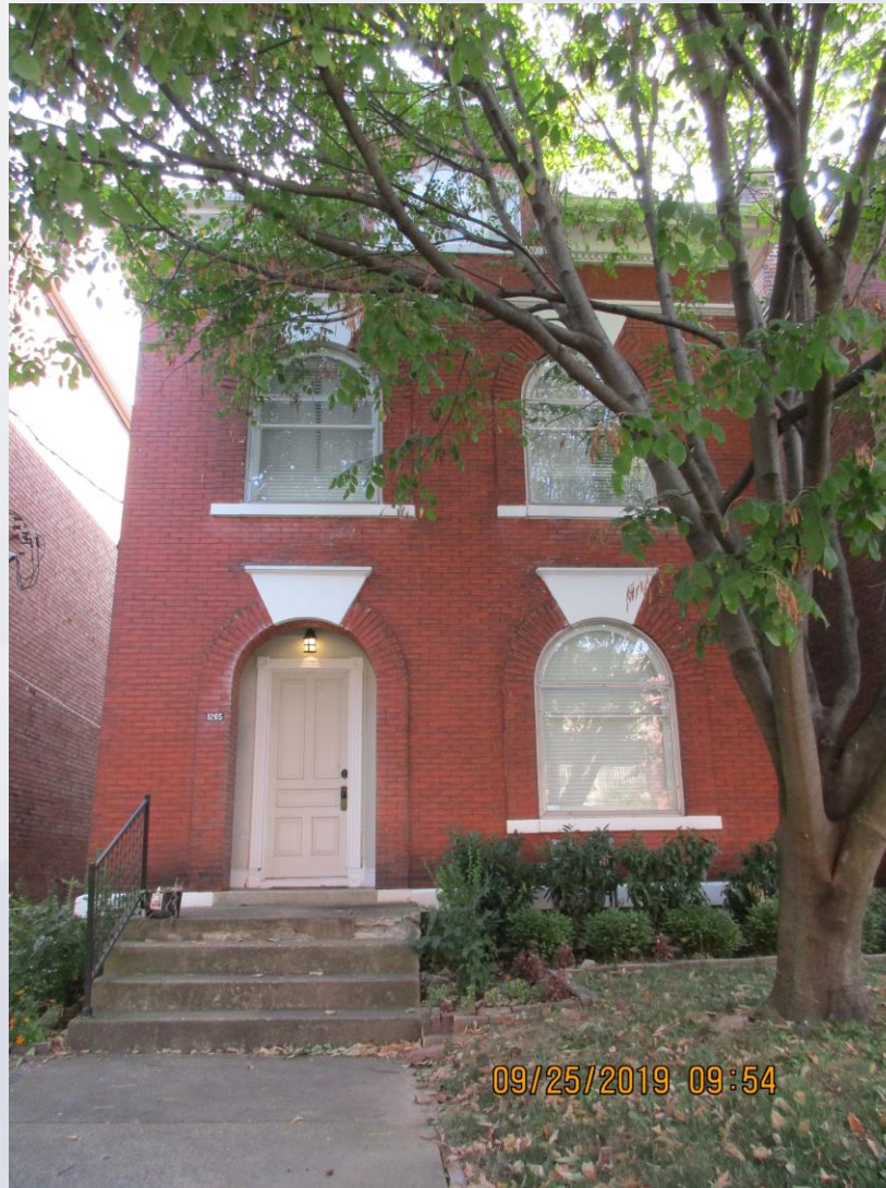
Adjacent to North