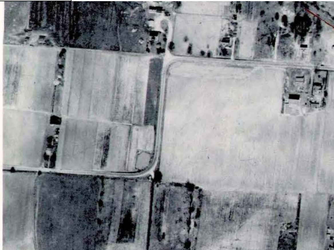
1946 Aerial Image