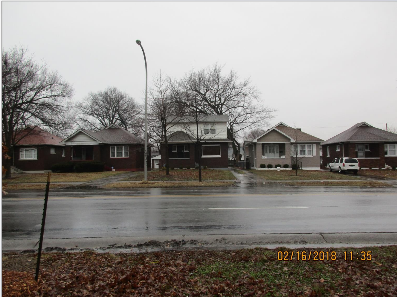
The properties across Eastern Parkway.