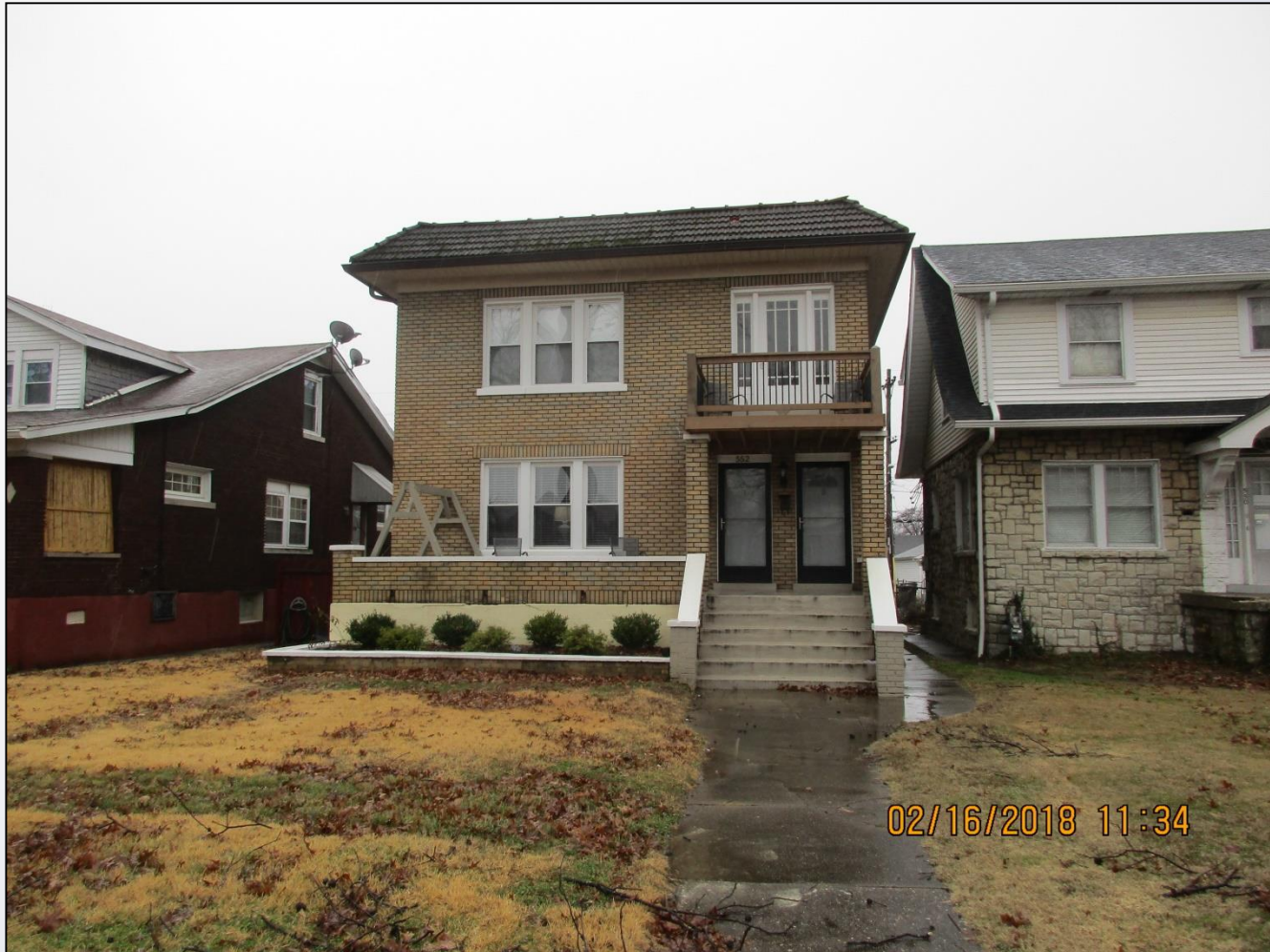
The front of the subject property.