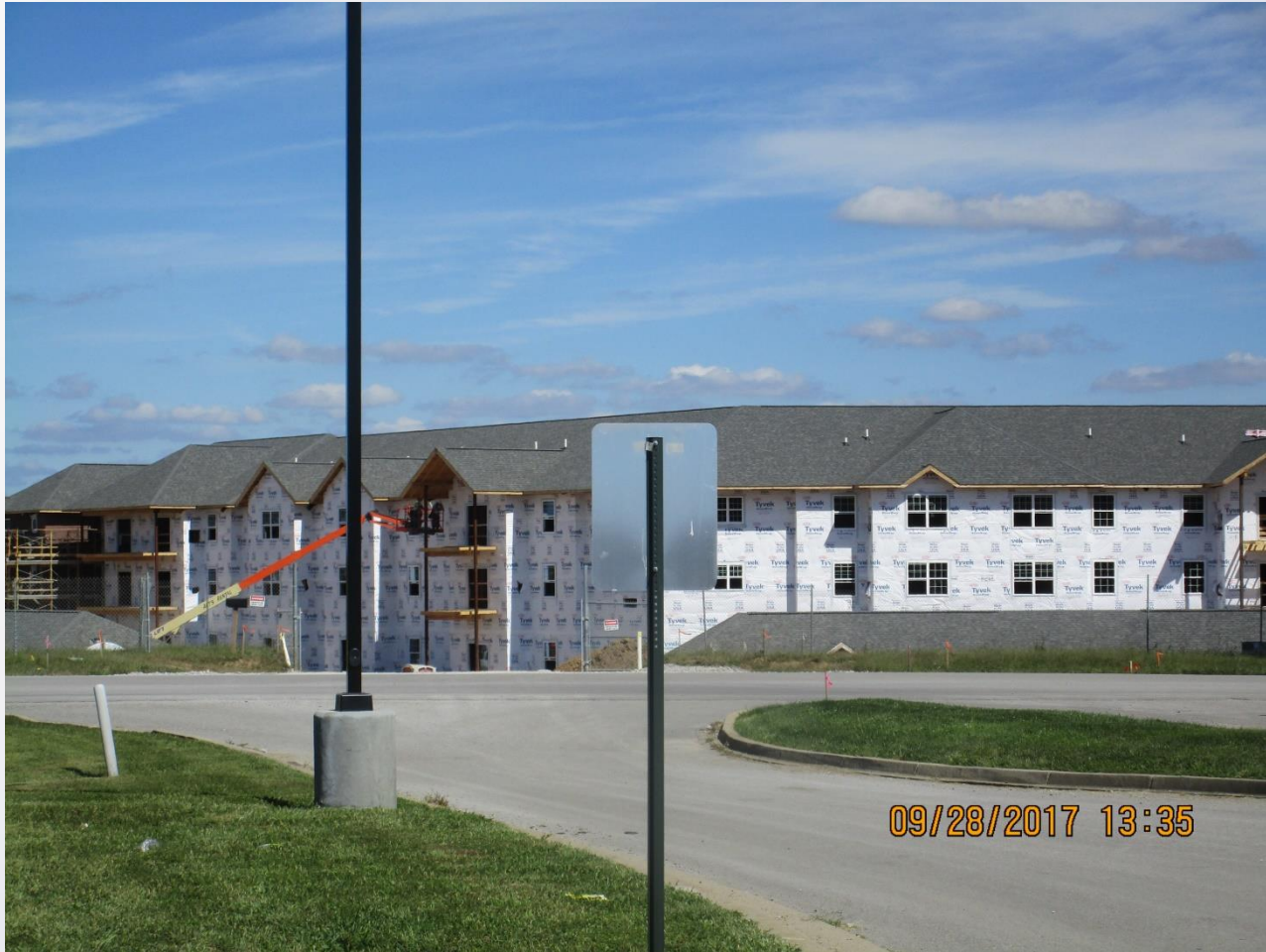
View to East Across Bush Farm Road