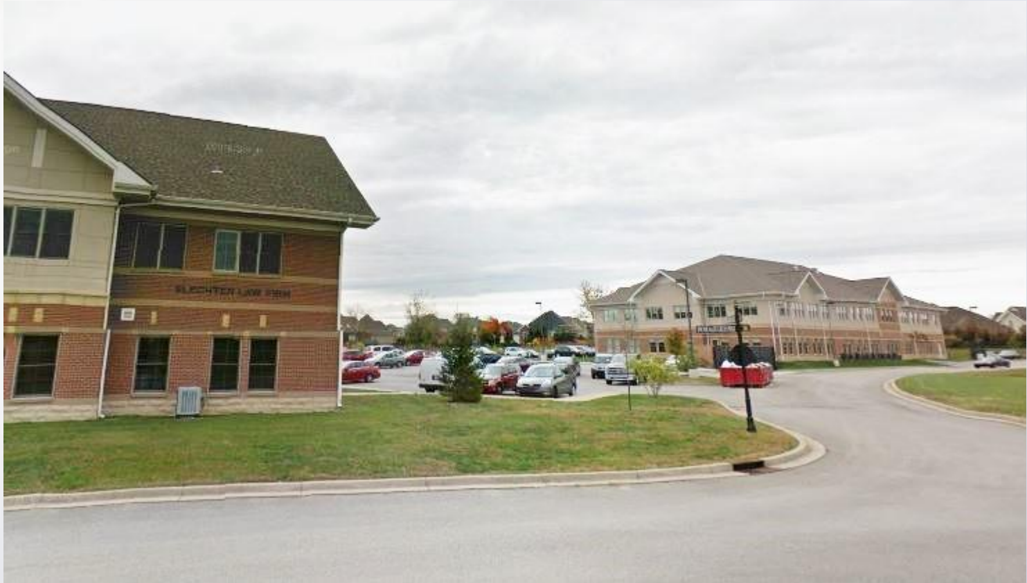
View to South Across Promenade Green Way