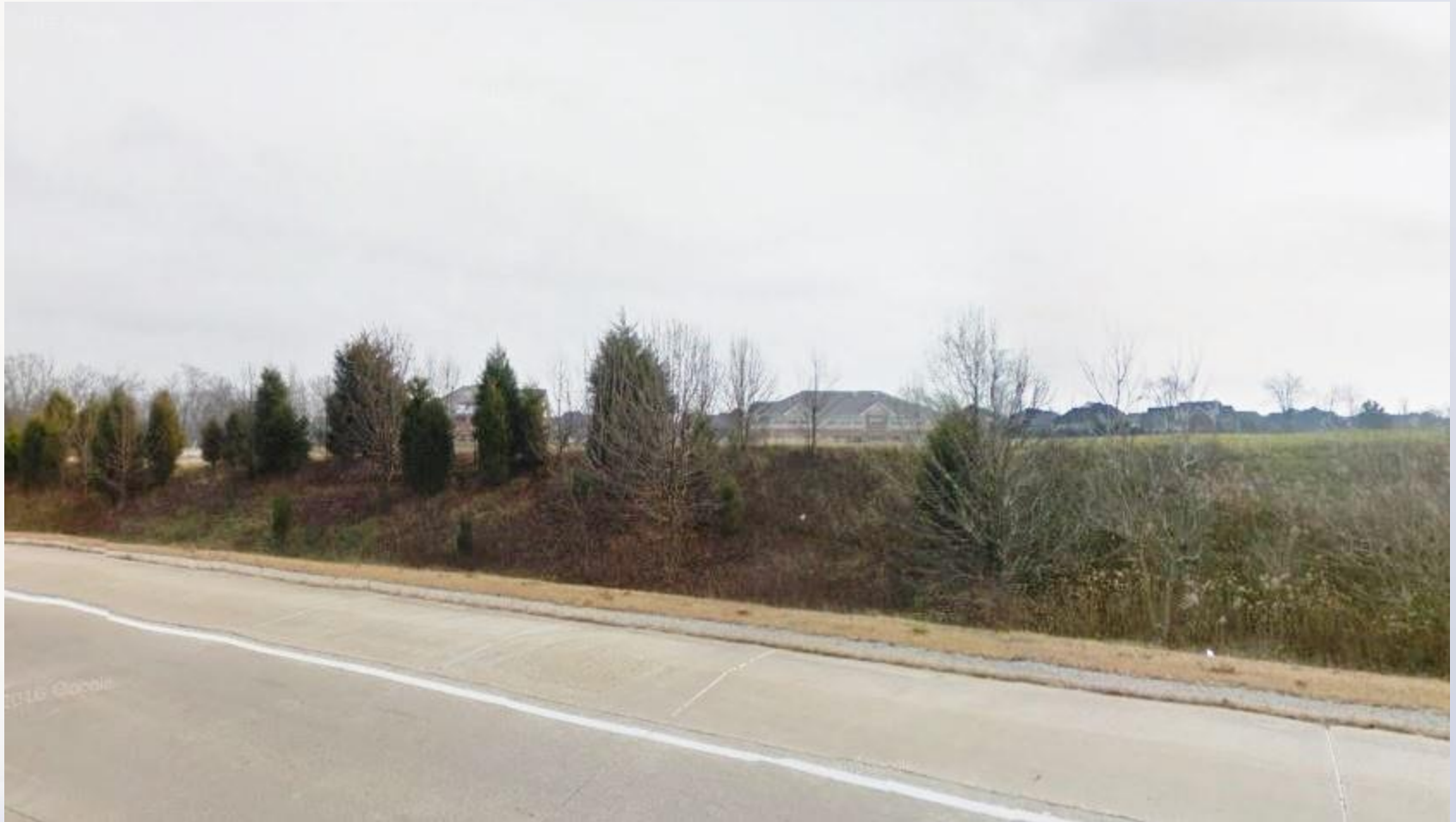
View to South Across Site From Old Henry Road