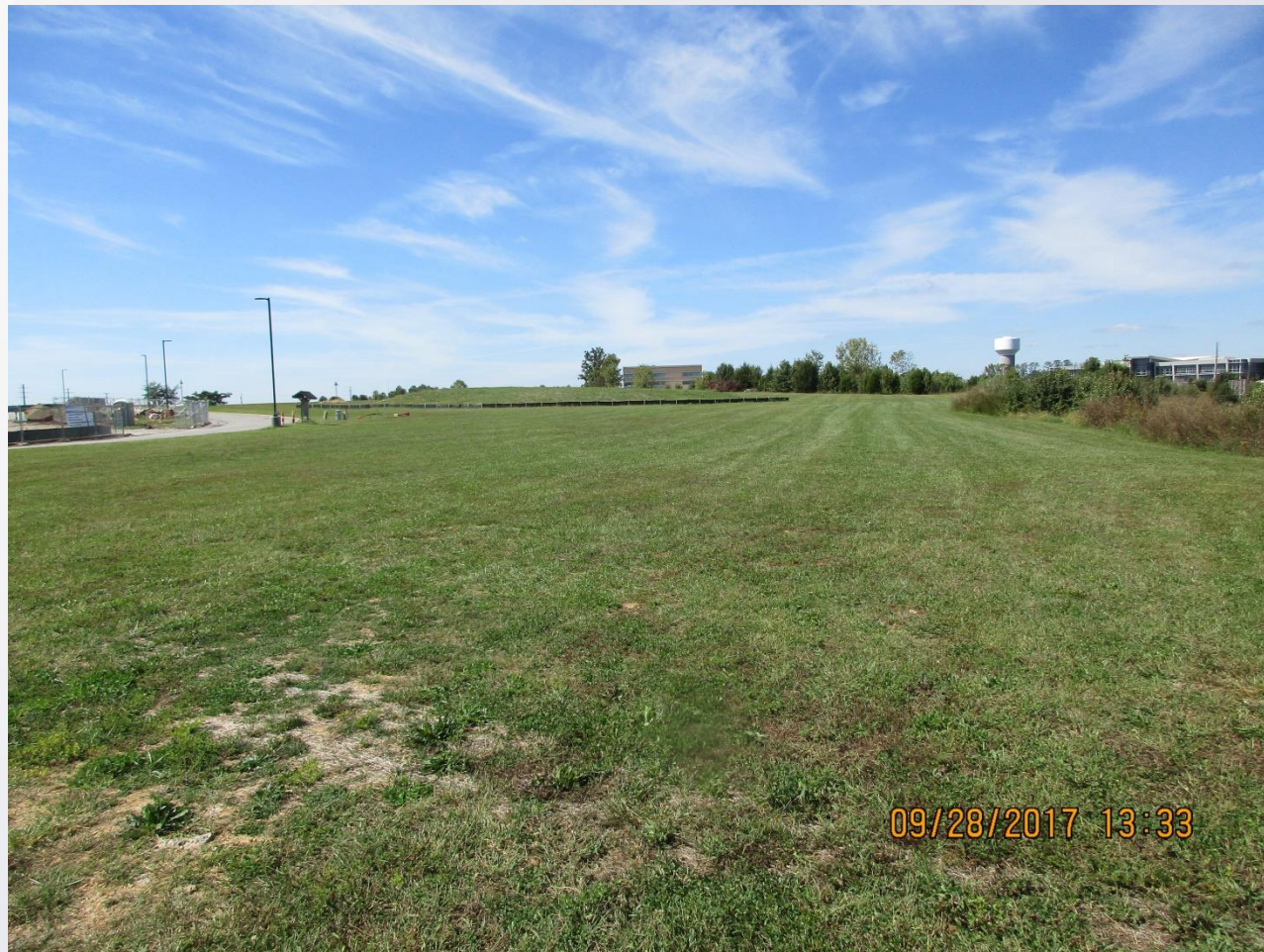
View to West Across Site From Bush Farm Road