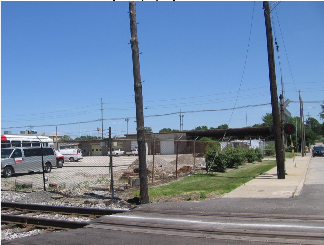
Adjacent property to the northeast