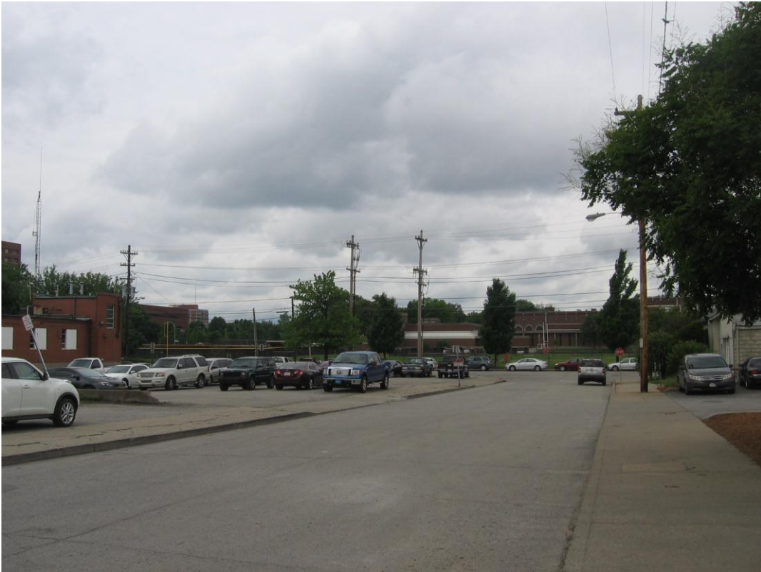
Looking west from East Bloom Street