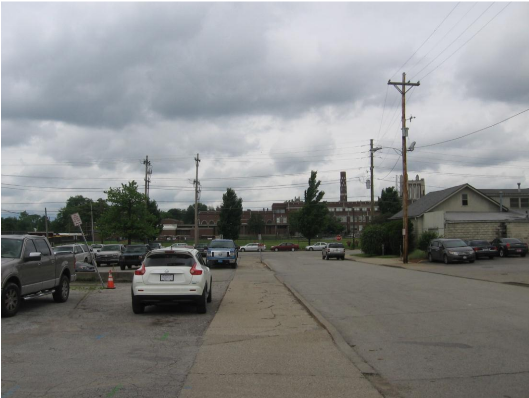
Looking west from East Bloom Street