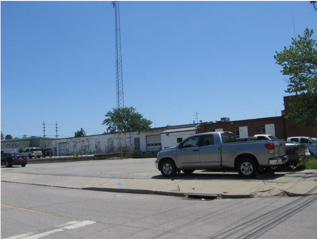
Adjacent property to the south. Building to be removed.