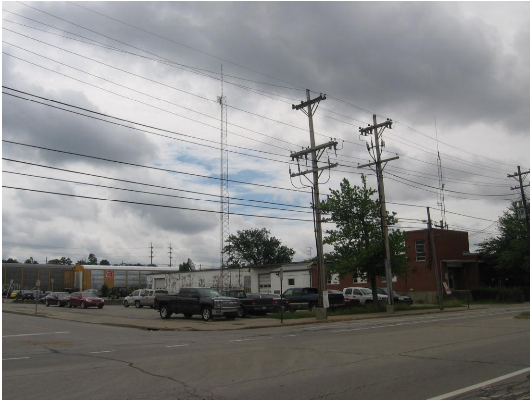
Subject site at corner of South Brook and East Bloom Streets