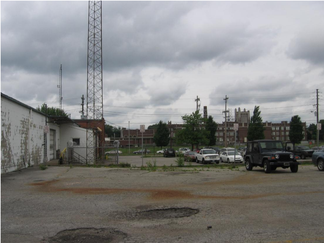
Looking west from the interior of the subject site