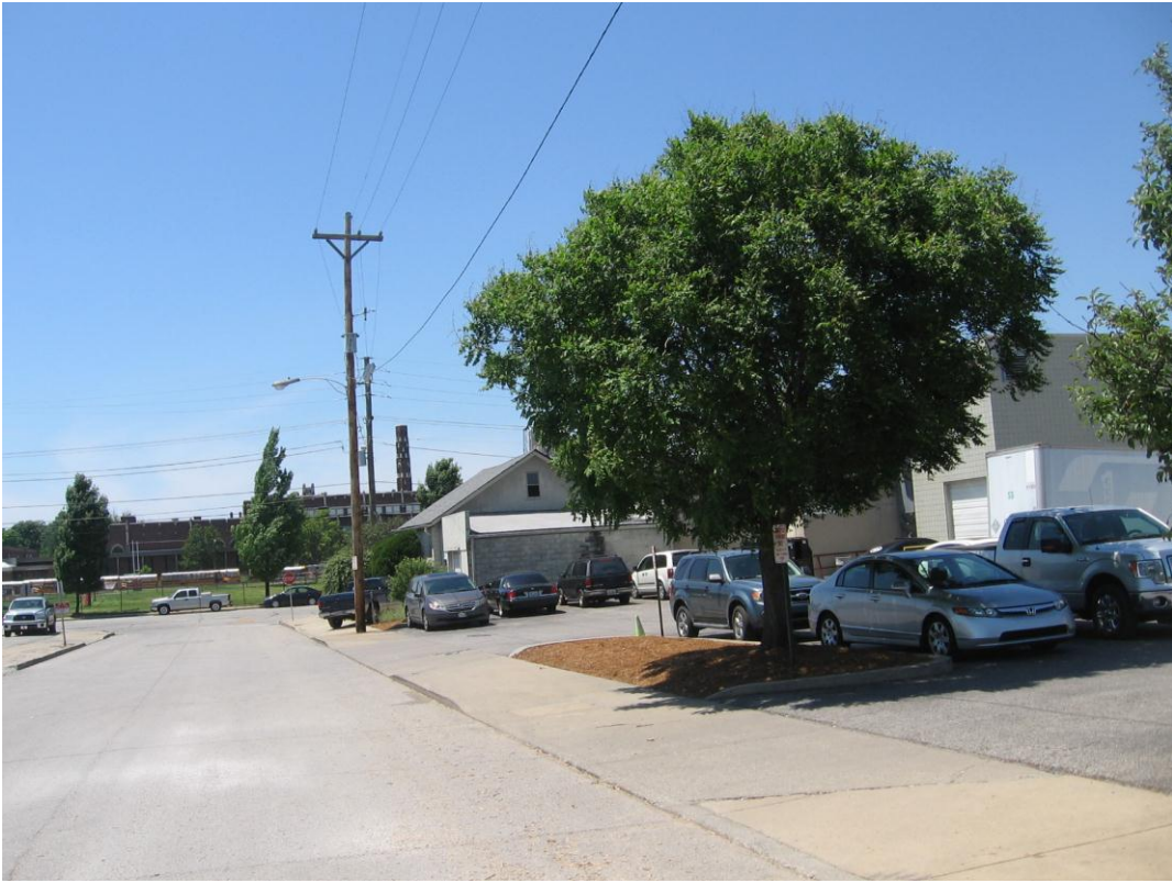
Adjacent property to the north (rear parking lot)