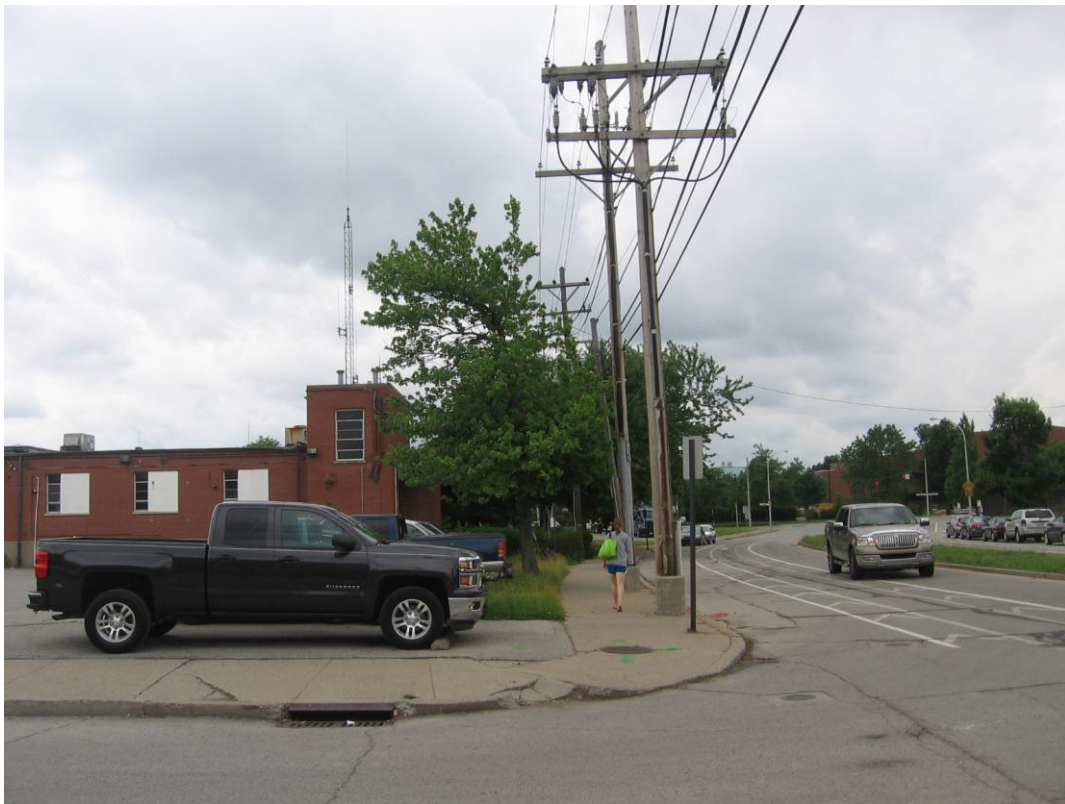
Looking south down South Brook Street