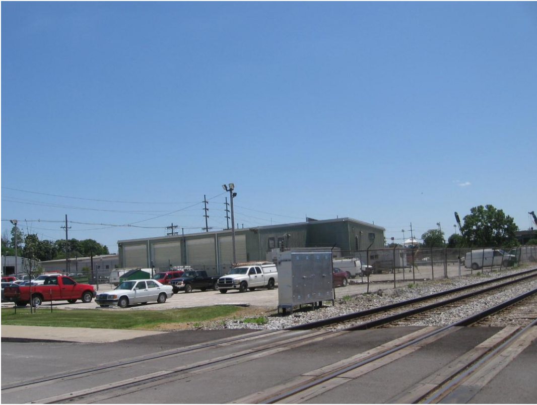
Adjacent property to the east