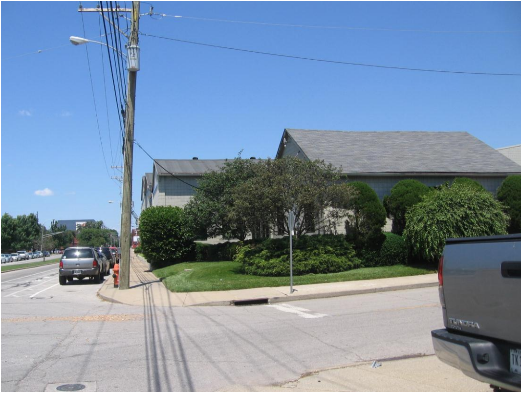
Adjacent property to the north