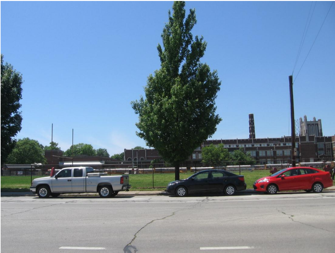
Adjacent property to the west