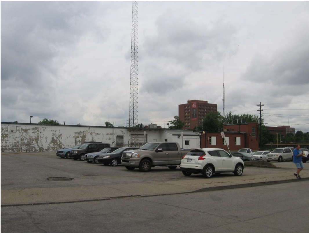
Looking from East Bloom south into subject site