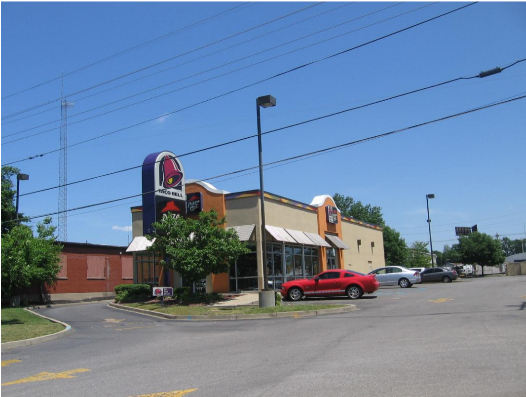
Existing Taco Bell at 1817 South Brook Street which is being replaced