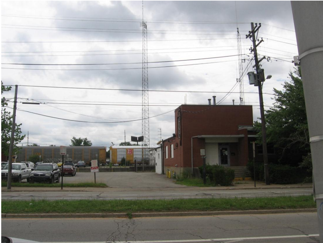
Looking from South Brook Street east into subject site. Existing building to be removed