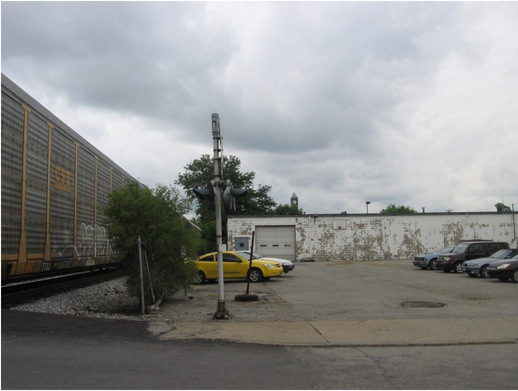
Looking south from East Bloom Street into rear of subject site