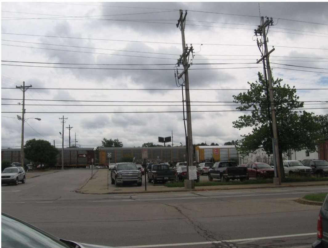
Looking from South Brook Street east into subject site