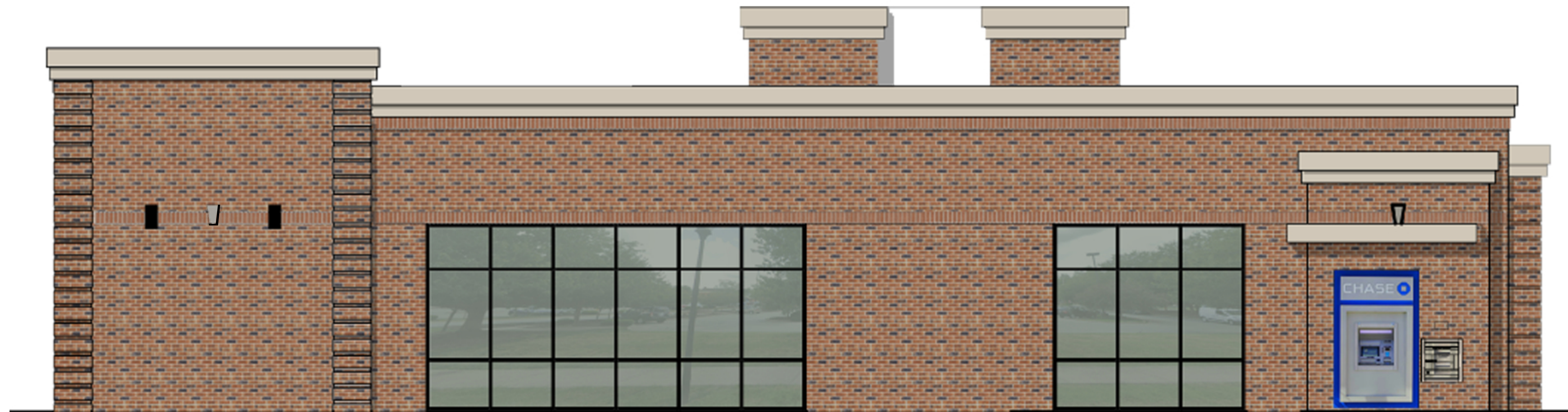
South Elevation Planning and Design