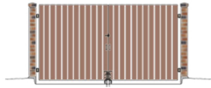
TRASH ENCLOSURE FRONT ELEVATION