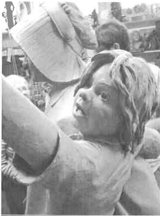
Left: Detail of child, Mother Catherine Spalding Statue, Raymond Graf Sculptor