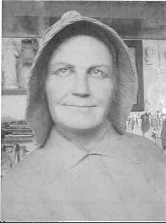
Left: Face of Mother Catherine Spalding Statue, Raymond Graf sculptor