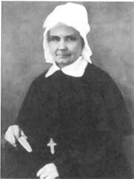
Portrait of Mother Catherine Spalding (Sisters of Charity of Nazareth, date unknown)

The reinforced concrete footer will be approx. 4' x 4' and 2' deep with the existing brick pavers replaced on top.