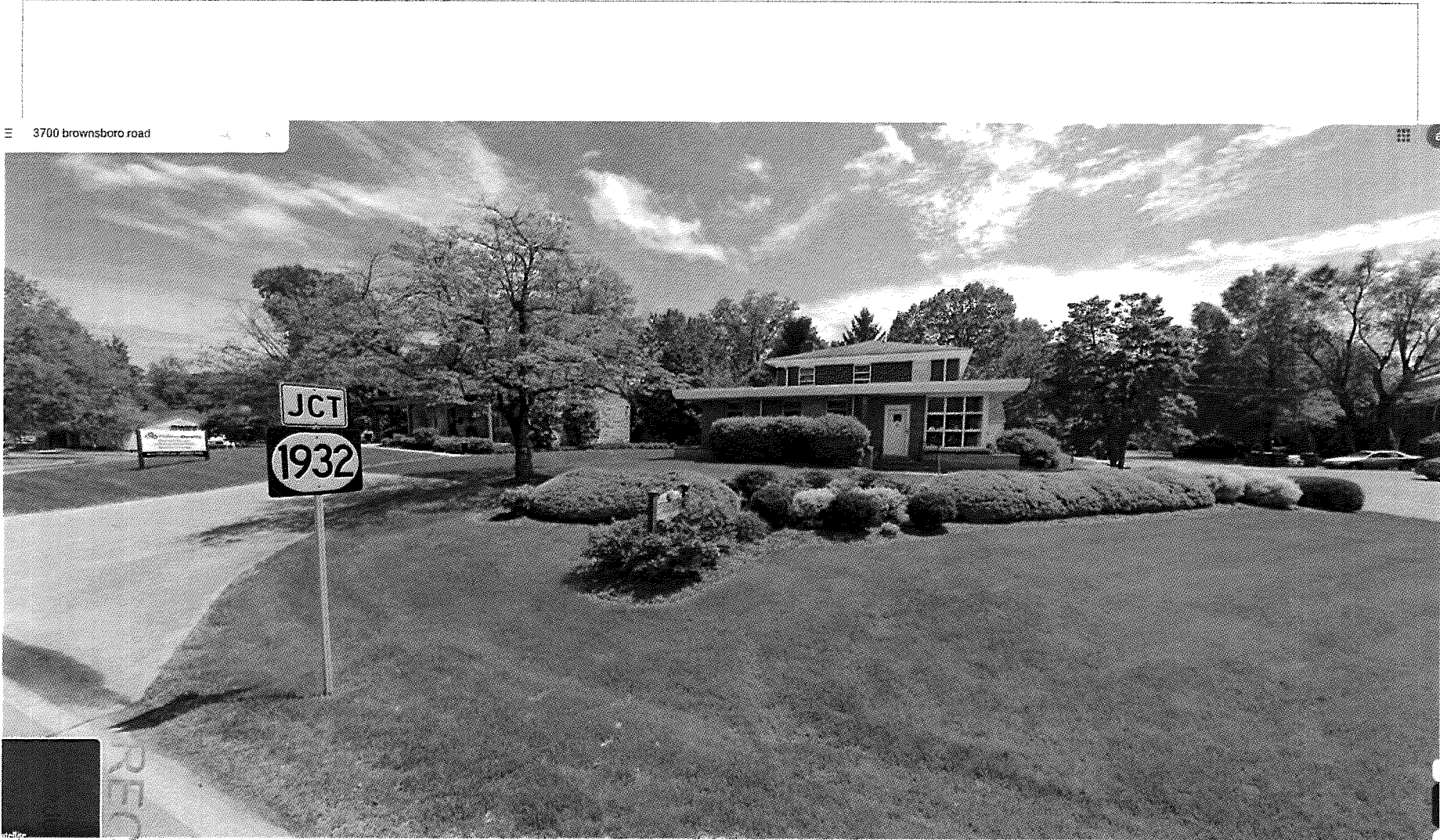
View of site from Brownsboro Road