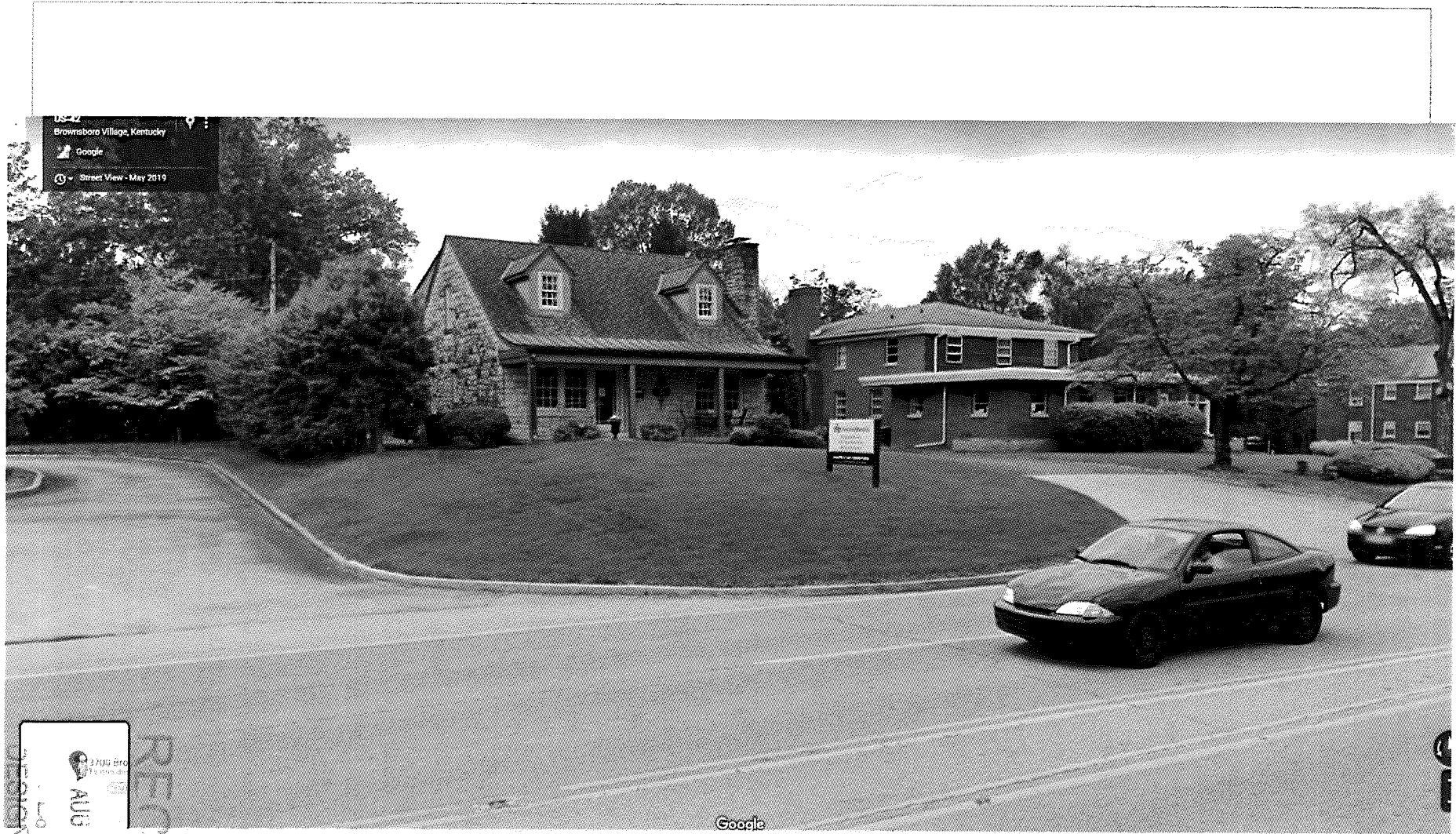
View of adjacent office (Preferred Benefits Health Plans).