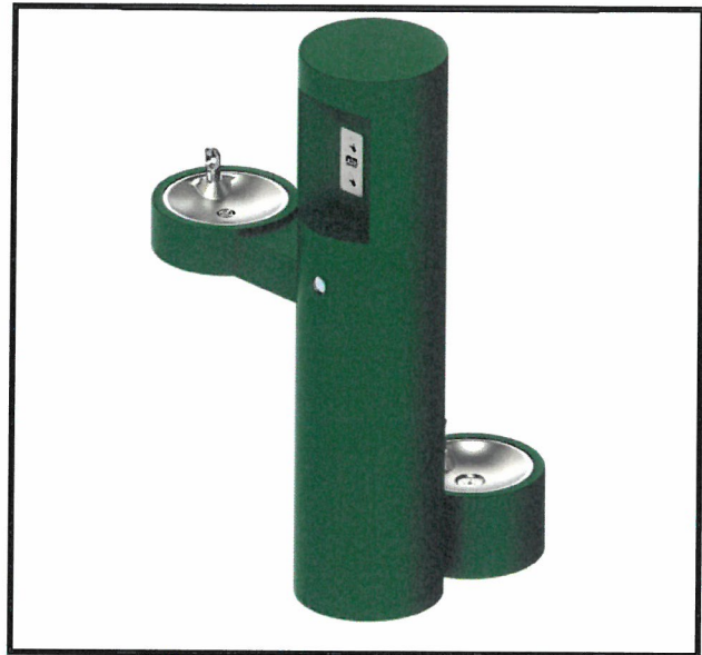
Model GYM75-PF Shown

2 This option is not available freeze-resistant.