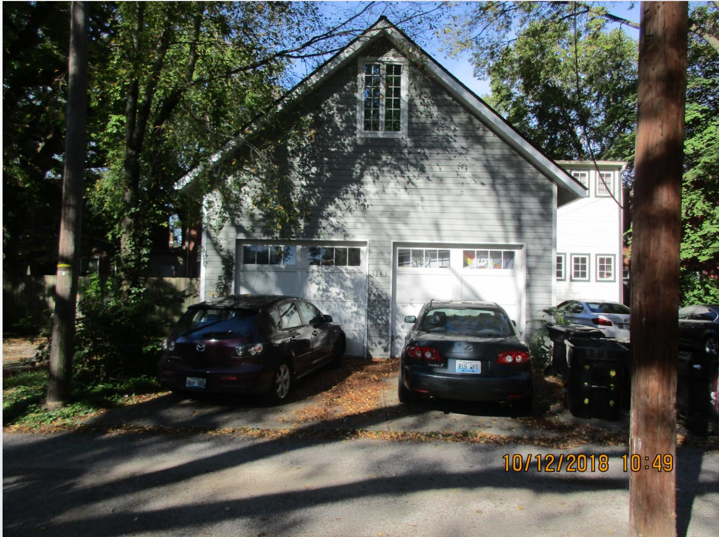
Rear at Alley